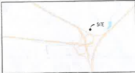
VICINITY MAP SCALE: 1"=1000'