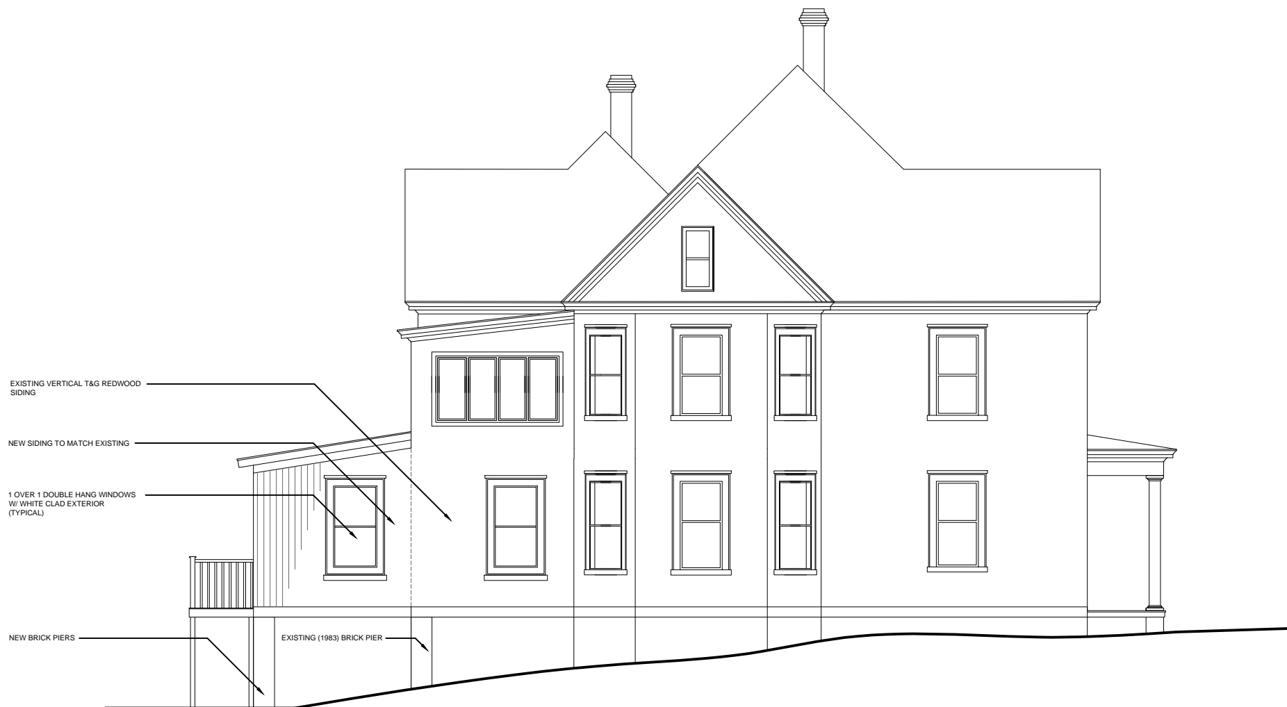
South Elevation View SCALE: 1/8"=1'-0"