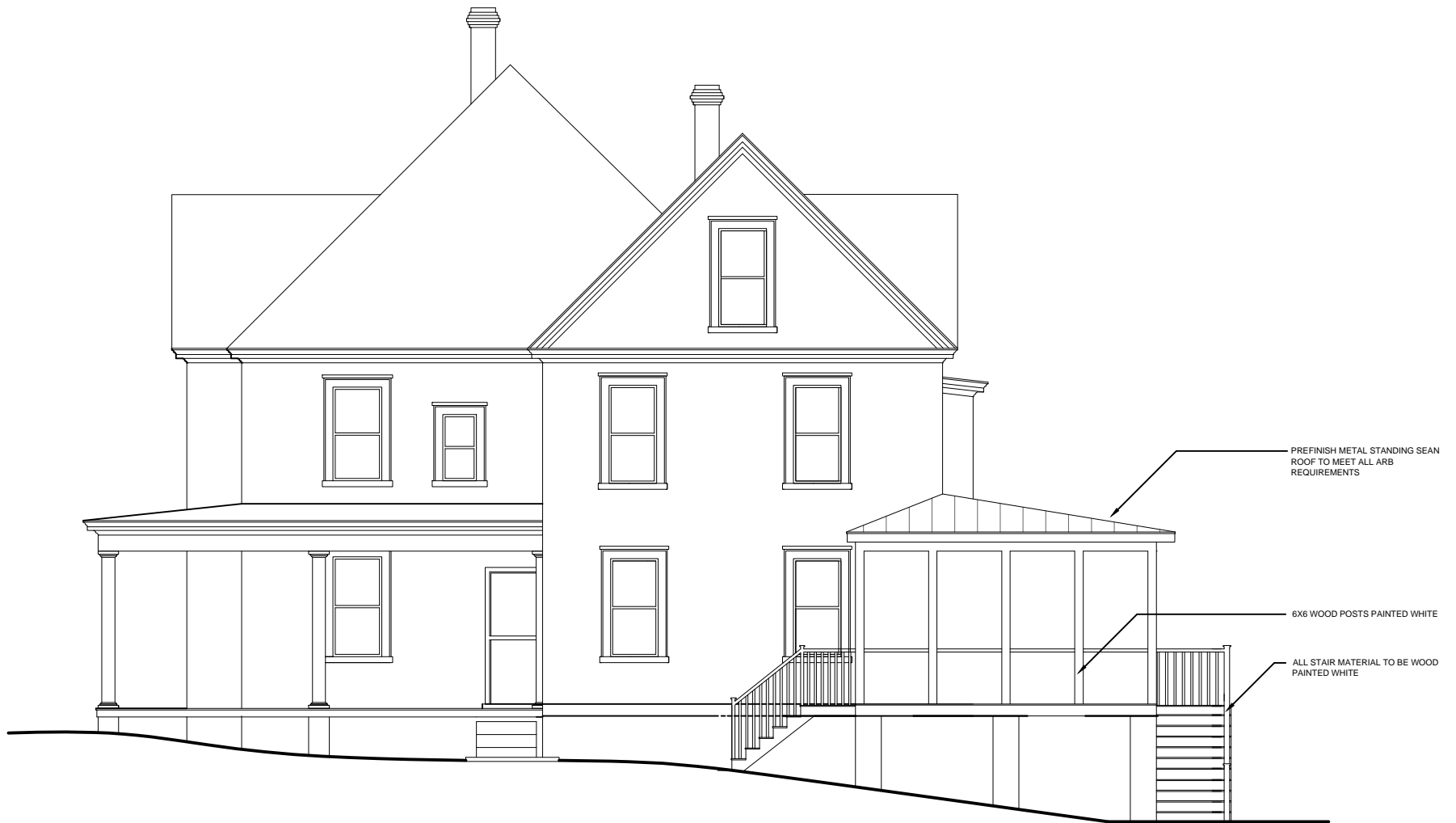
North Elevation View SCALE: 1/8"=1'-0"