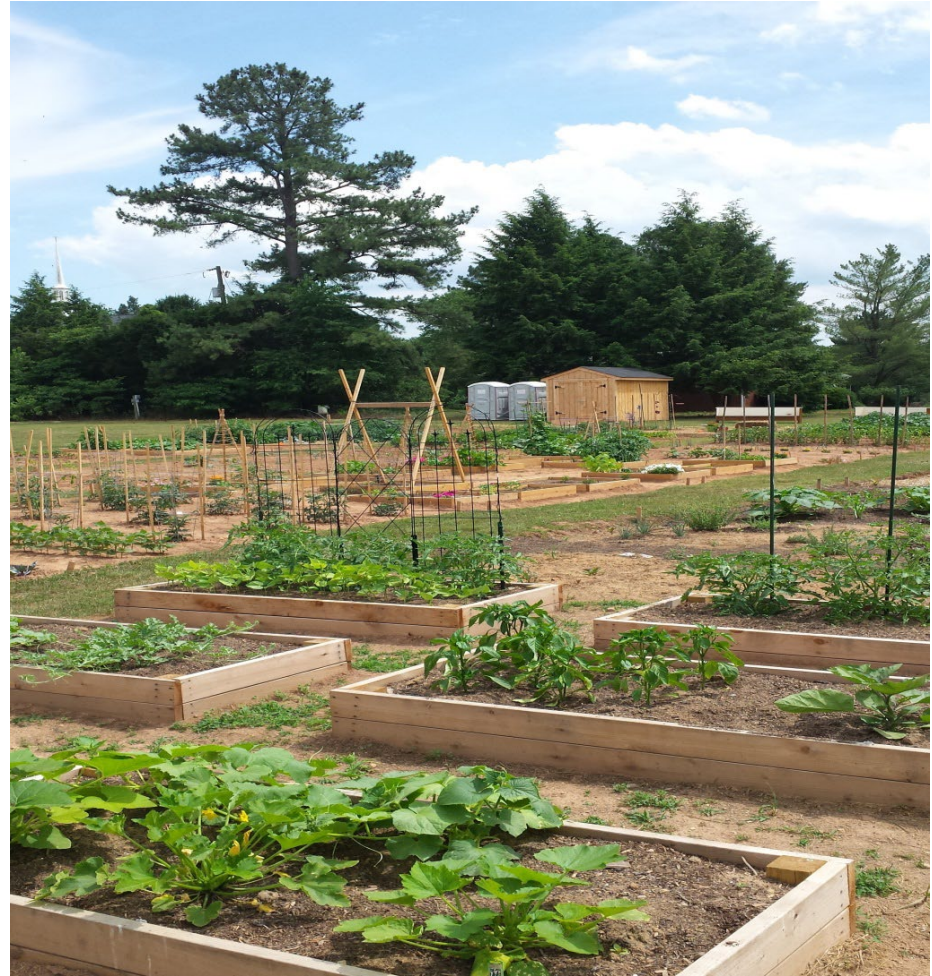
Remington Community Garden