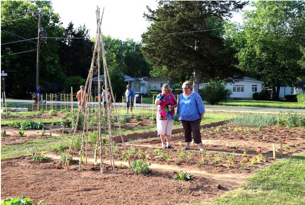
Remington Community Garden