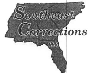
EXHIBIT A DETAILED FEES/SERVICES