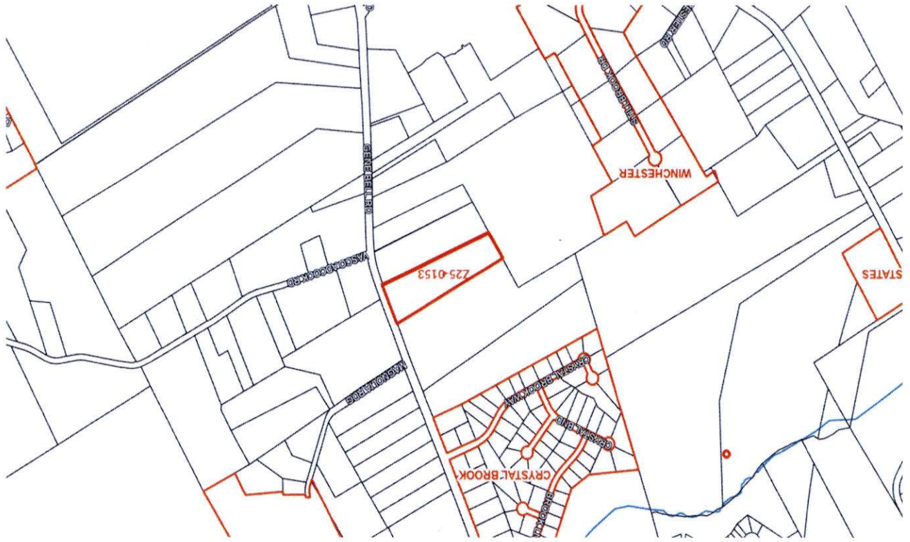
Subdivisions surrounding property: