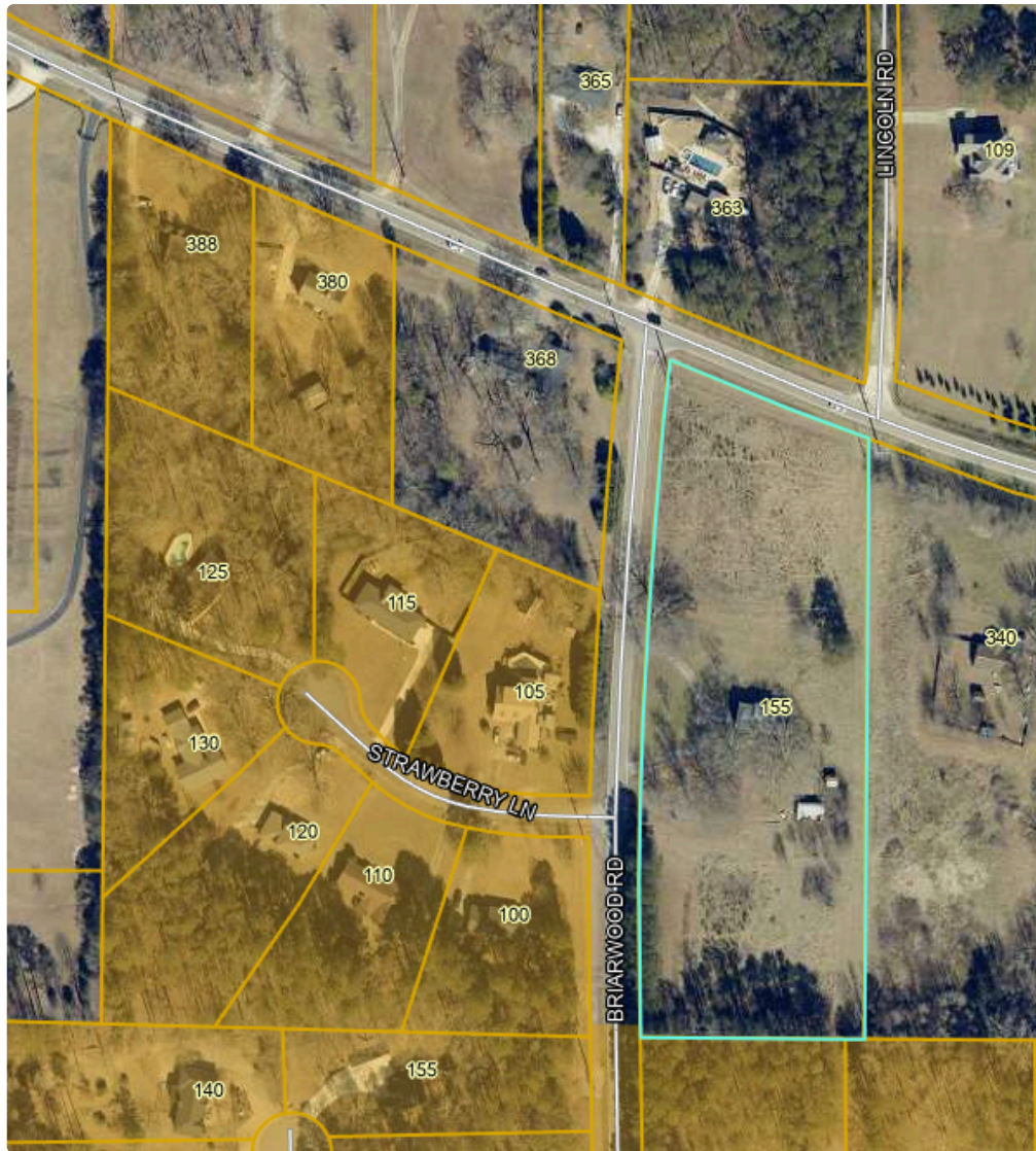
Fayette County Tax Map