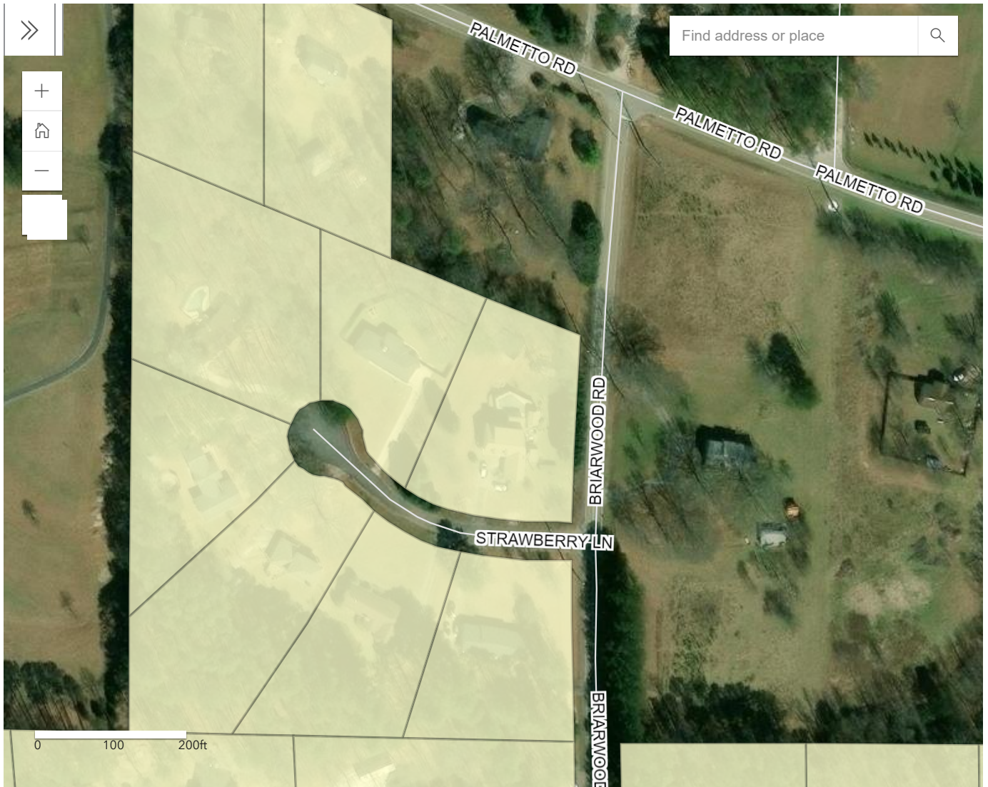
Town of Tyrone Zoning Map