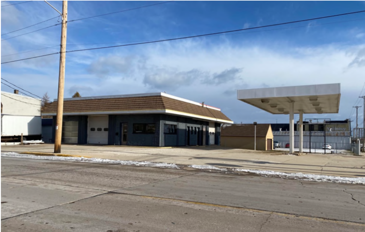
Existing Building photos - before work began