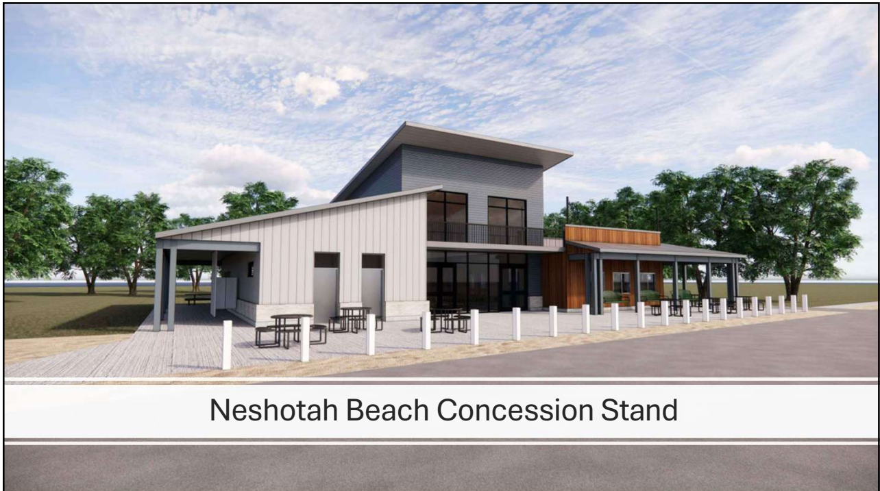
Neshotah Beach Concession Stand