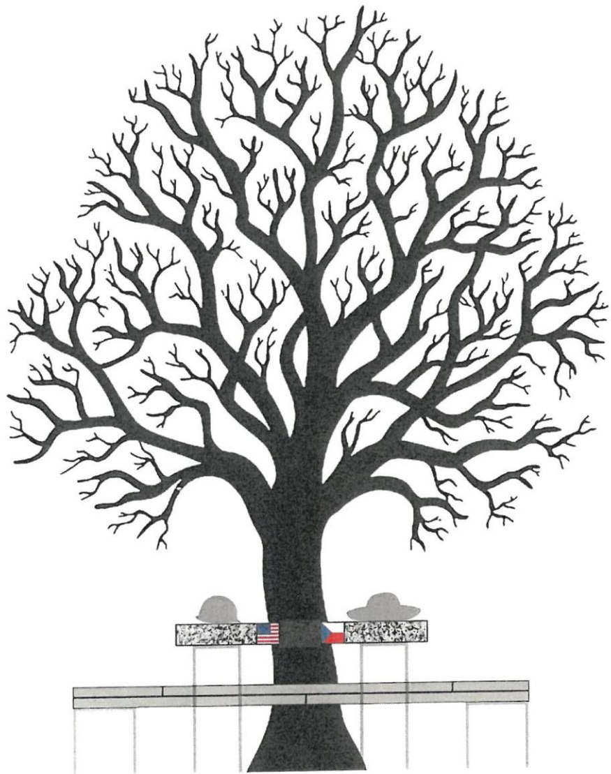
Two Rivers - USA - 2022