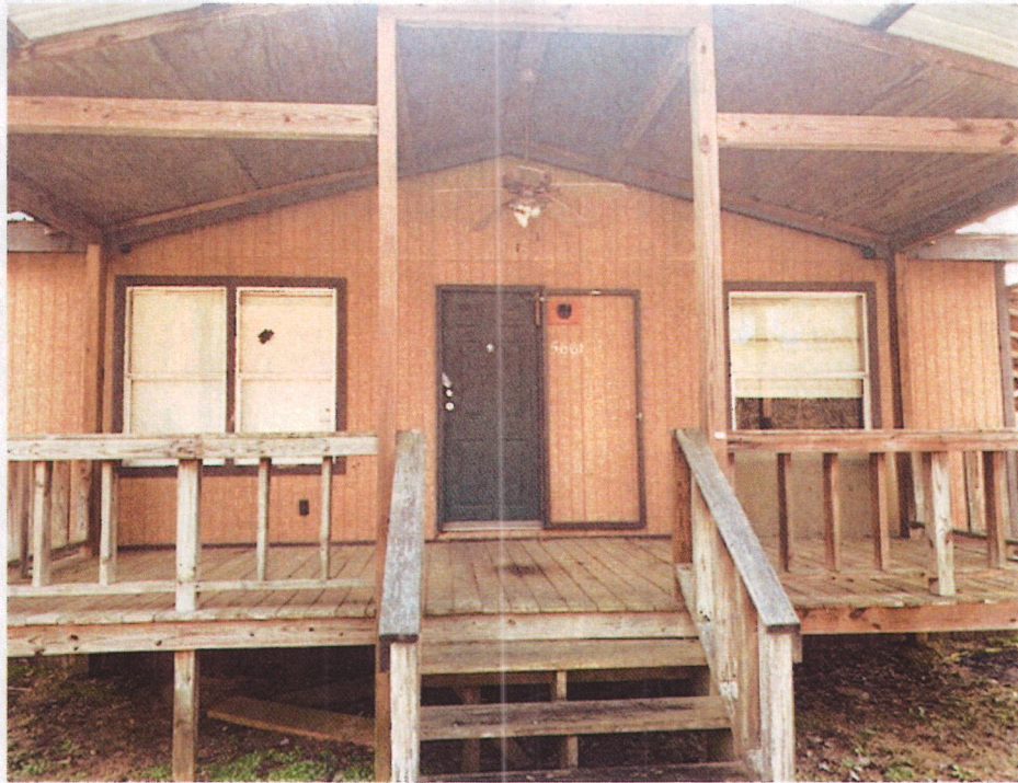
FRONT OF TRAILER