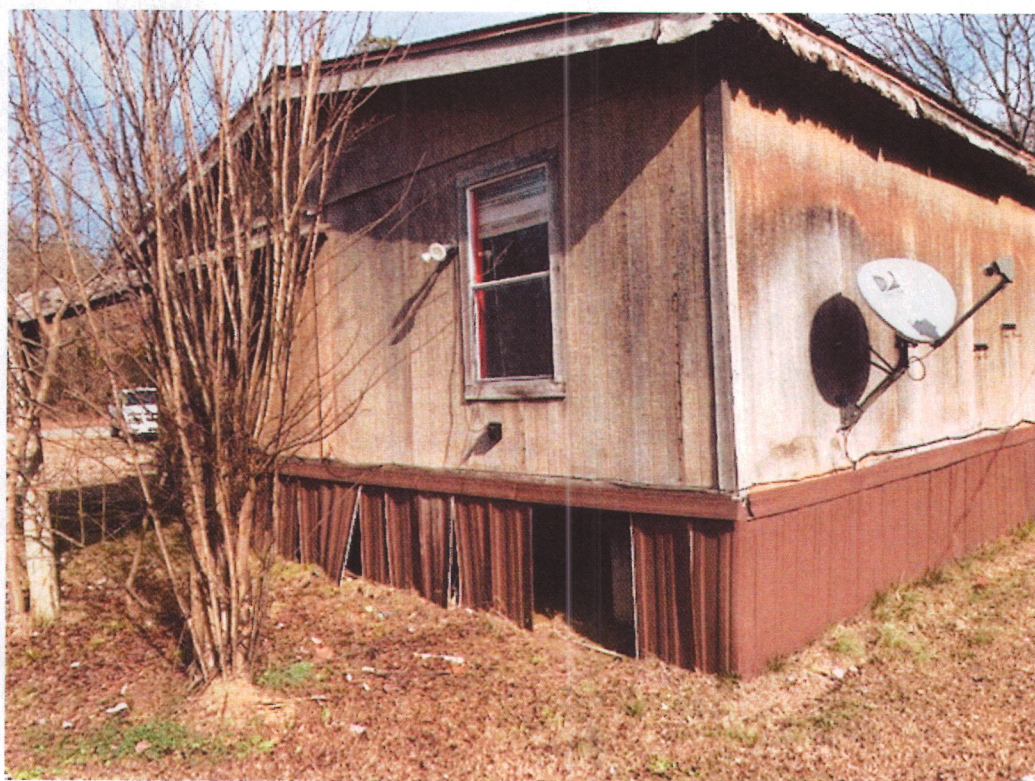
RIGHT SIDE WITH LEAN TO