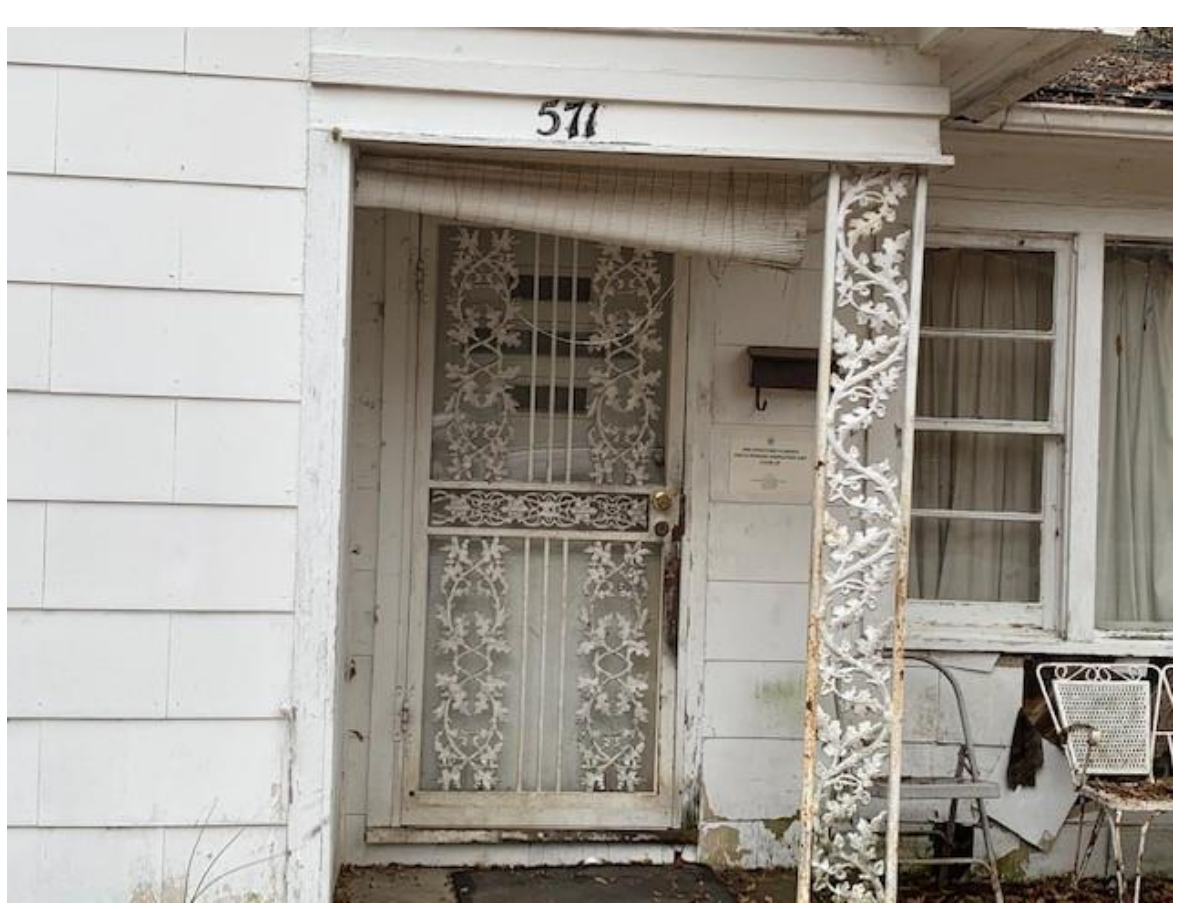
571 N. Church St.