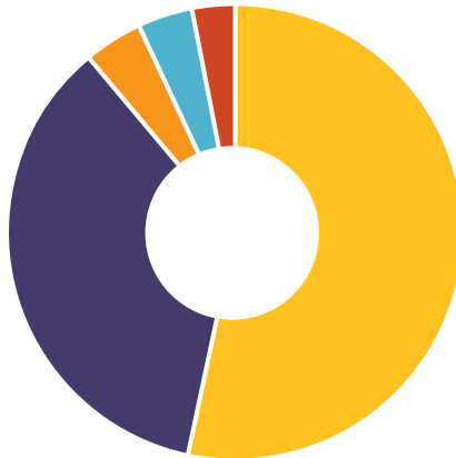
Figure 2: Community-Wide Emissions by Sector