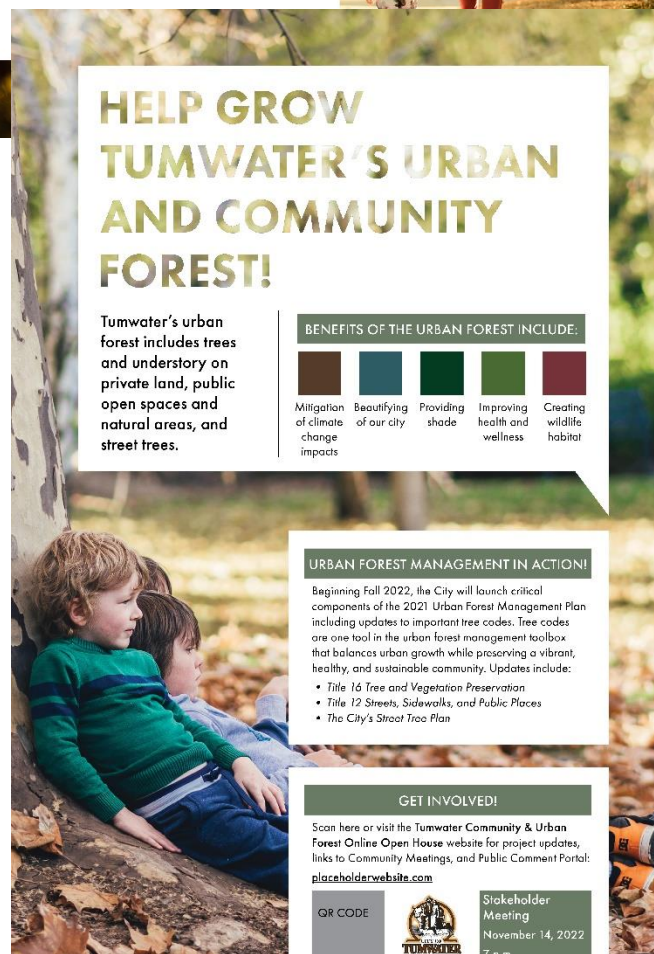
Figure 2. Project Poster