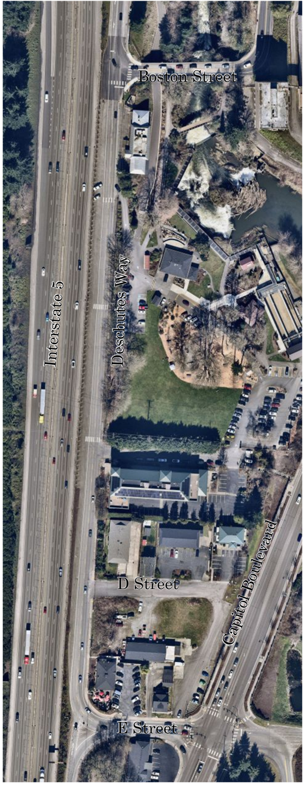
Figure 2. Existing Condition on Deschutes Way and D St.