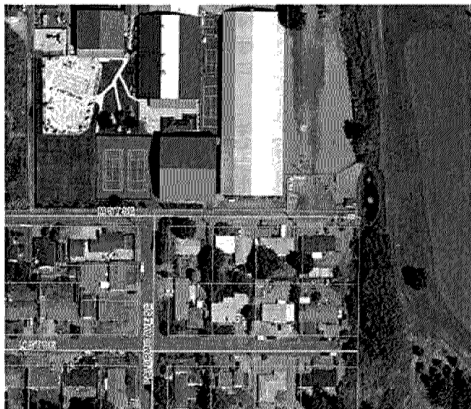
Figure 1: Aeration Lagoon Project Area

The U.S. Environmental Protection Agency constructed the Palermo Aeration Lagoon as one component of the remedy selected for the Palermo Wellfield Superfund Site to remediate tetrachloroethylene and trichloroethylene in the ground water supply. Periodic maintenance of the lagoon is required to keep the system functioning properly. This scope of work is intended to help guide the contractor through bidding and execution of the project. The accompanying diagrams are profiles of the lagoon to aid in estimating the volume of sediment to be removed.