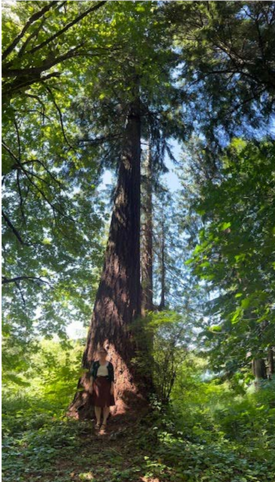
Figure 3. Nominated Tree. Person at base of tree is 5 foot 5 inches in height for scale.