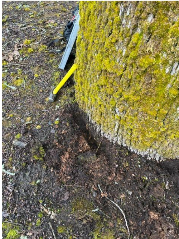
Photo Showing Lack of Root Flare at Base