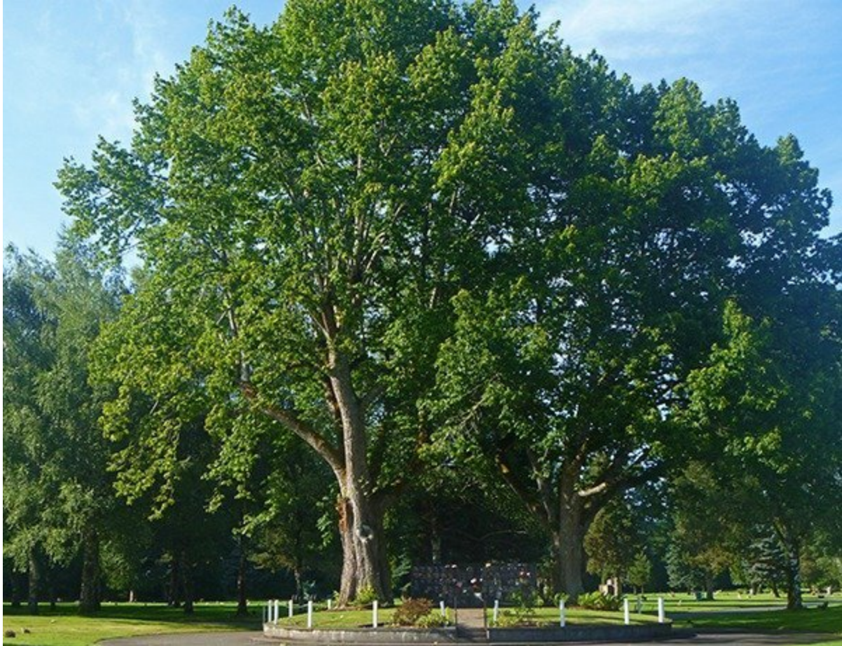
Figure 2. American chestnut trees at Mills & Mills Funeral Home

Alyssa Jones Wood filed a nomination form for the two American chestnut trees at 5725 Littlerock Road SW. These trees have been designated by American Forests as Champion Trees, but had not yet received City recognition and designation. A plaque at the site the trees were planted in 1846 and are therefore 176 years old.