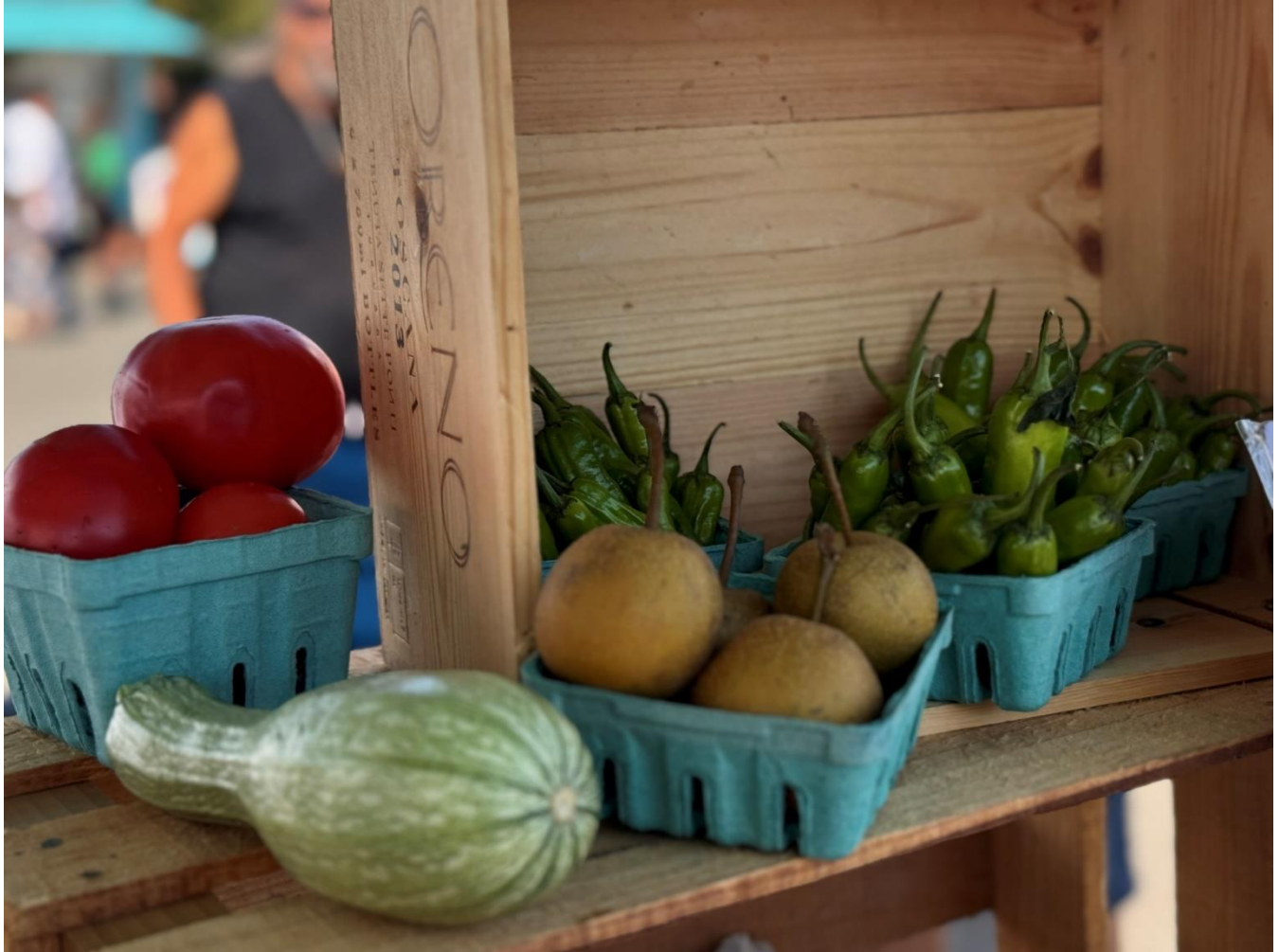
Power House Ranch produce at Tumwater Farmers Market

Adopted _____, 2025 by Resolution No. 2025-015