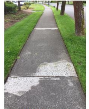
A sidewalk that's been repaired by grinding.

For public safety, sidewalks must be built to City specifications. A permit is needed to do the tree and sidewalk work, but the permit fees will be waived for the sidewalk repair. Specifications and permits are available through the City's Community Planning & Development Department (CP&D) located on the 2nd floor of City Hall at 601 4th Avenue, 360.753.8314.