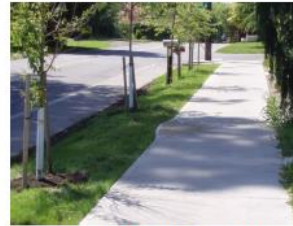
A sidewalk on San Francisco Avenue.

Sidewalk damage typically occurs over time and may be caused by tree roots, the ground settling or from cars parked on the sidewalk.