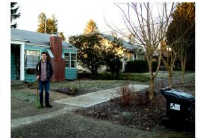
Sidewalk replacement work completed by a contractor, hired by homeowner.