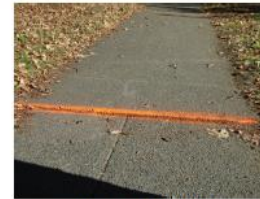
Cracks can be trip hazards.