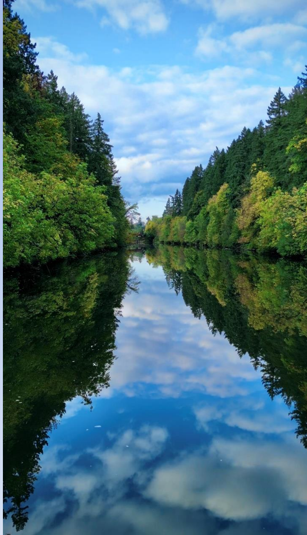
“Nature’s Mirror” First Place – Matt Hanson Location – Tualatin River