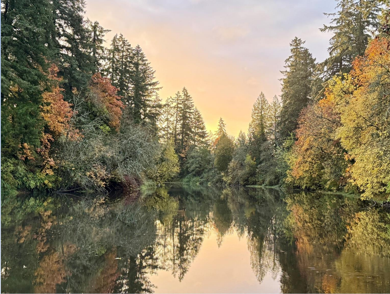
“Tualatin Community Park at Sunrise” First Place – Diana Fitts Location – Tualatin Community Park