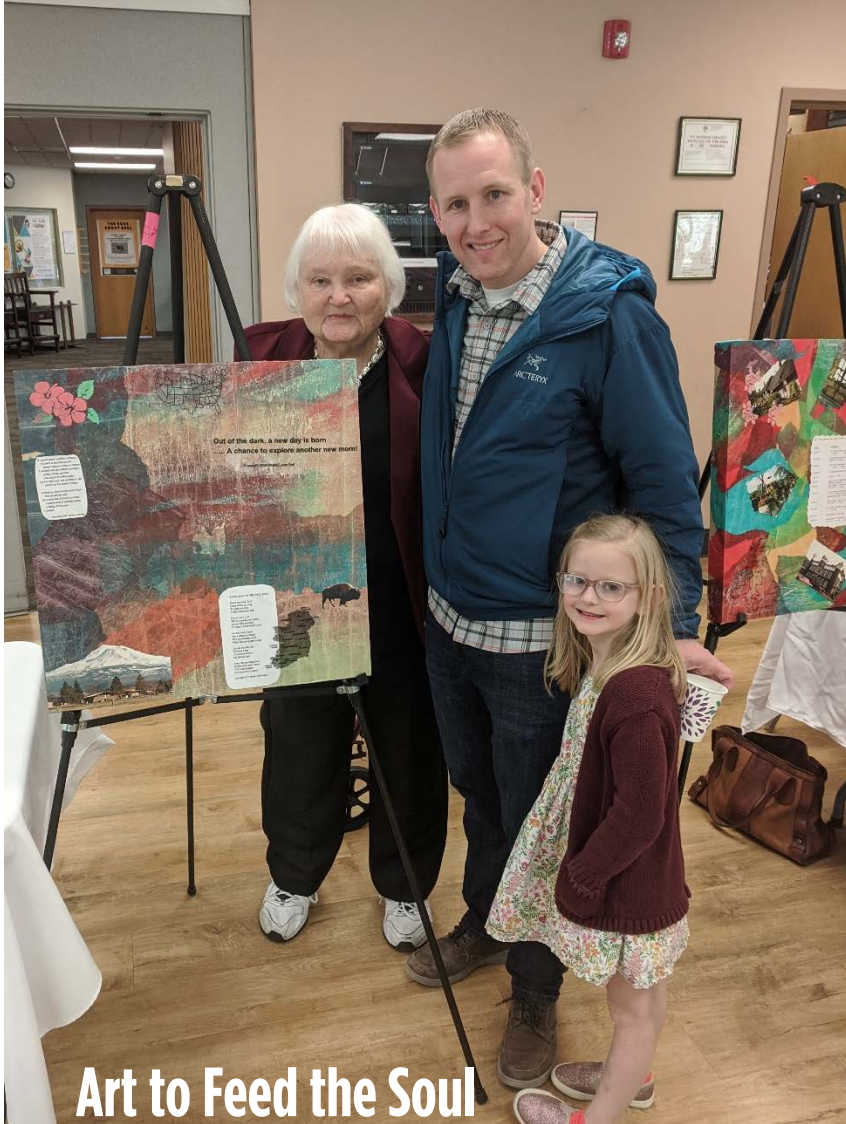
Art to Feed the Soul