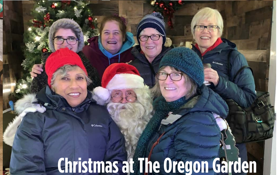
Christmas at The Oregon Garden