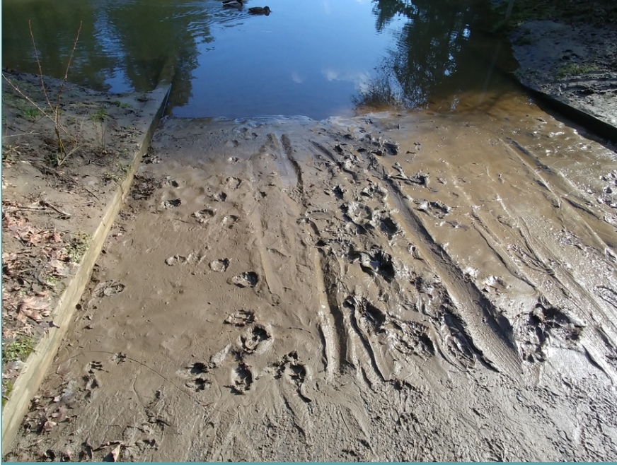
TUALATIN COMMUNITY PARK BOAT RAMP