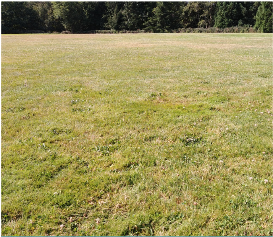
LOWER TURF ATFALATI PARK