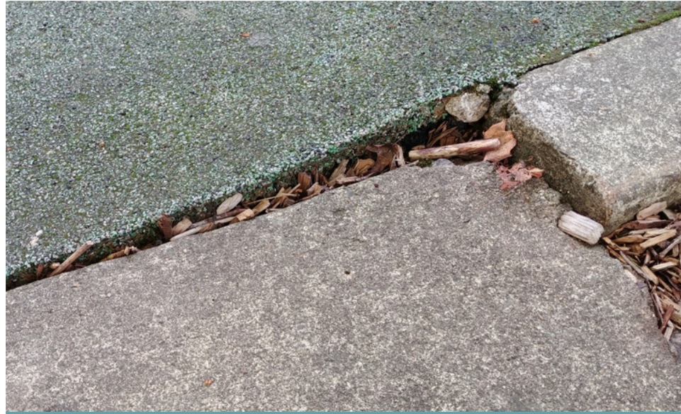
TUALATIN COMMONS PLAZA SURFACE