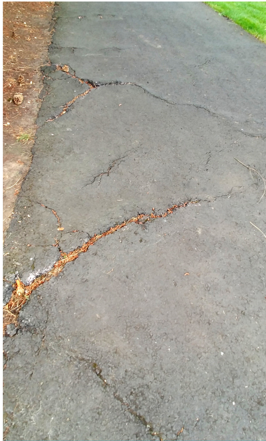
CHIEFTAIN DAKOTA PATH SURFACE