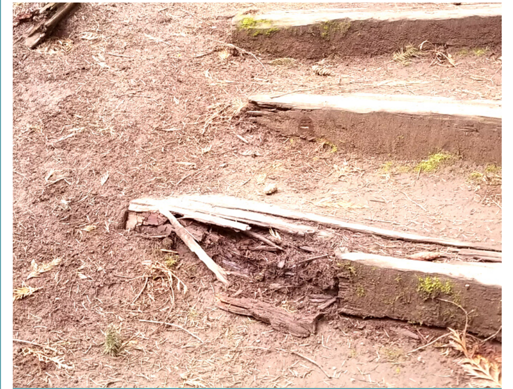
LITTLE WOODROSE PARK STAIRS