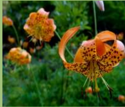
2. Plant Locally Native Plants