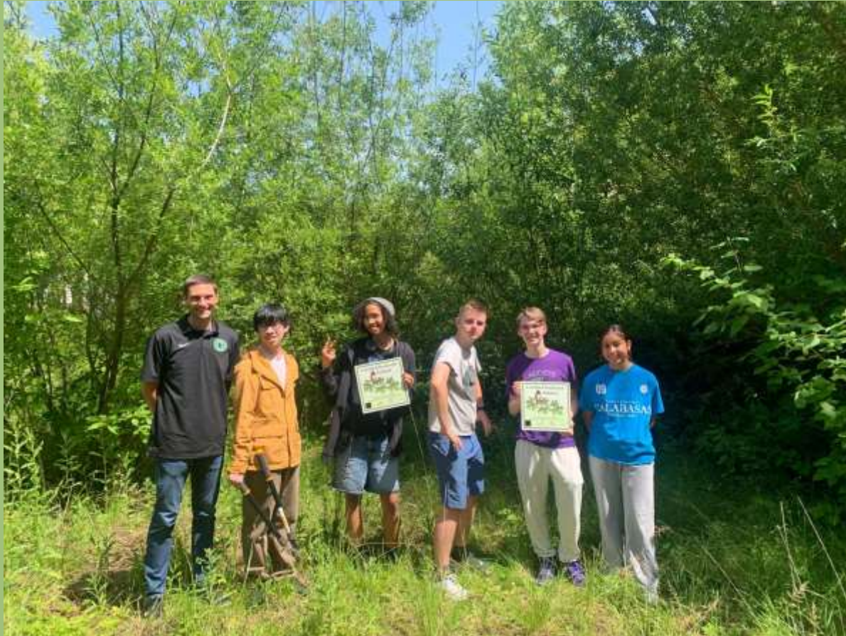
Tualatin High School's Environmental Design Class, Platinum Certified - naturescaped rain swale June 11, 2025