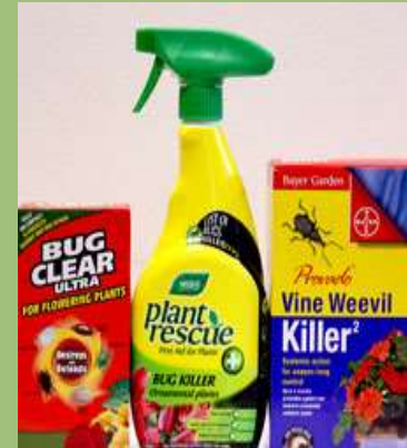
3. Reduce Pesticide Use & Commit to IPM