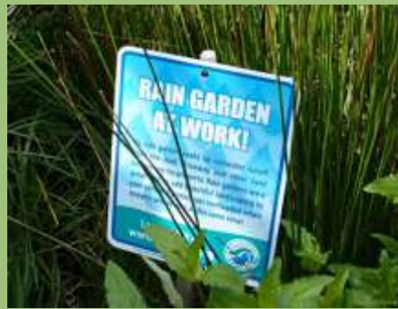
5. Stormwater and Soil Management