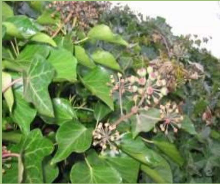
1. Manage Plants Recommended for Removal