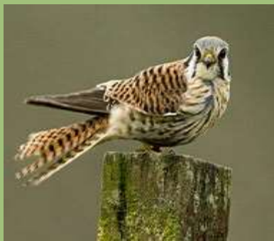
4. Support Wildlife