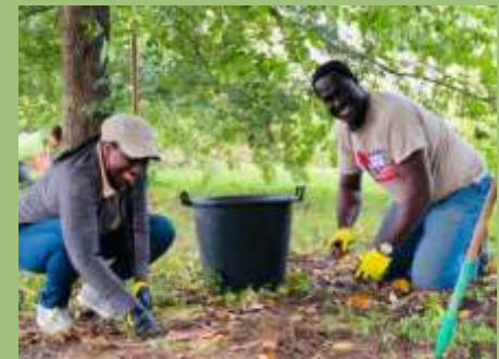
6. Education and Volunteerism