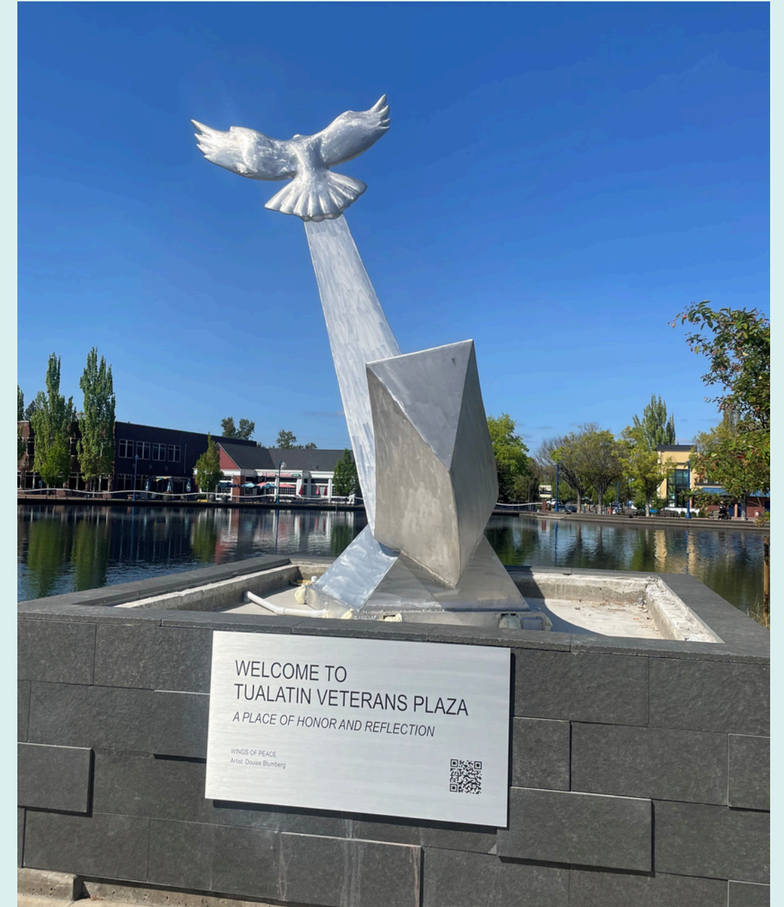
Wings of Peace