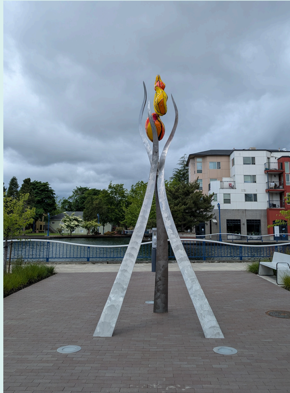
Flames of Honor