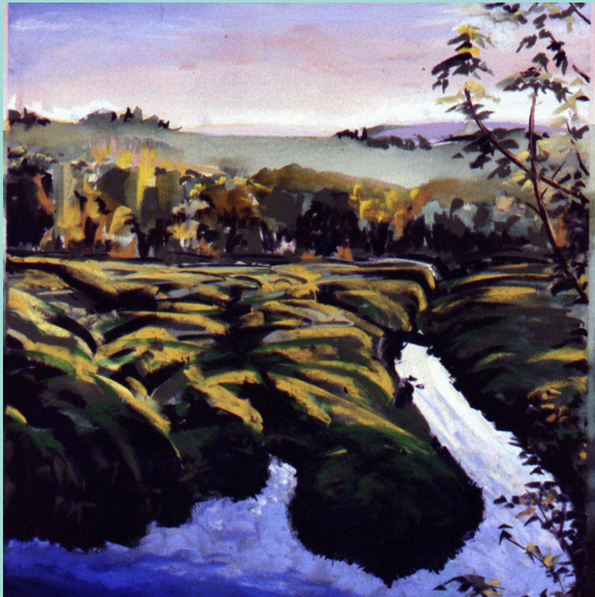
"Hedges Creek Wetland"