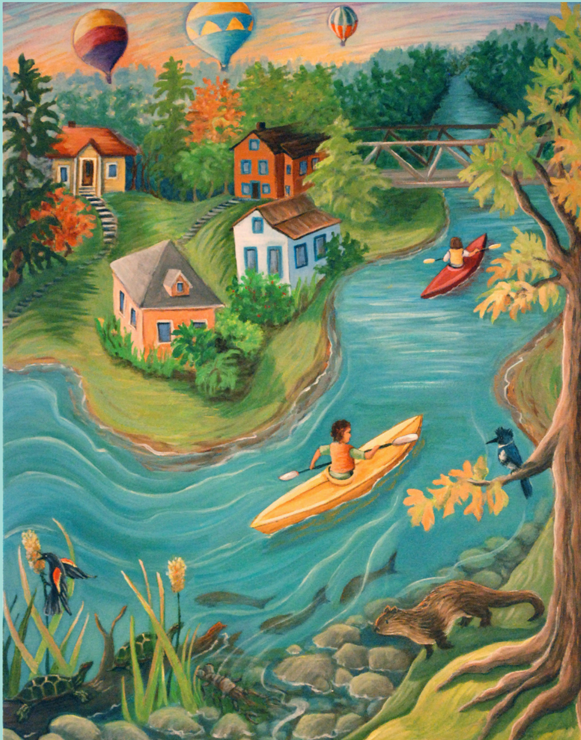
“100 Years on the River” by Cathy Fields