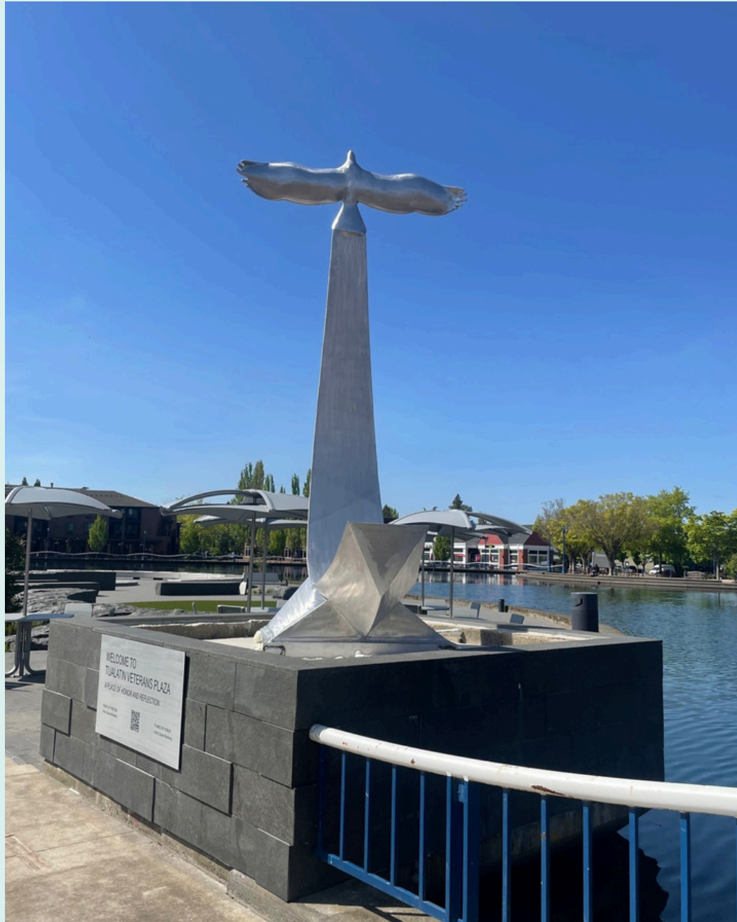
Wings of Freedom