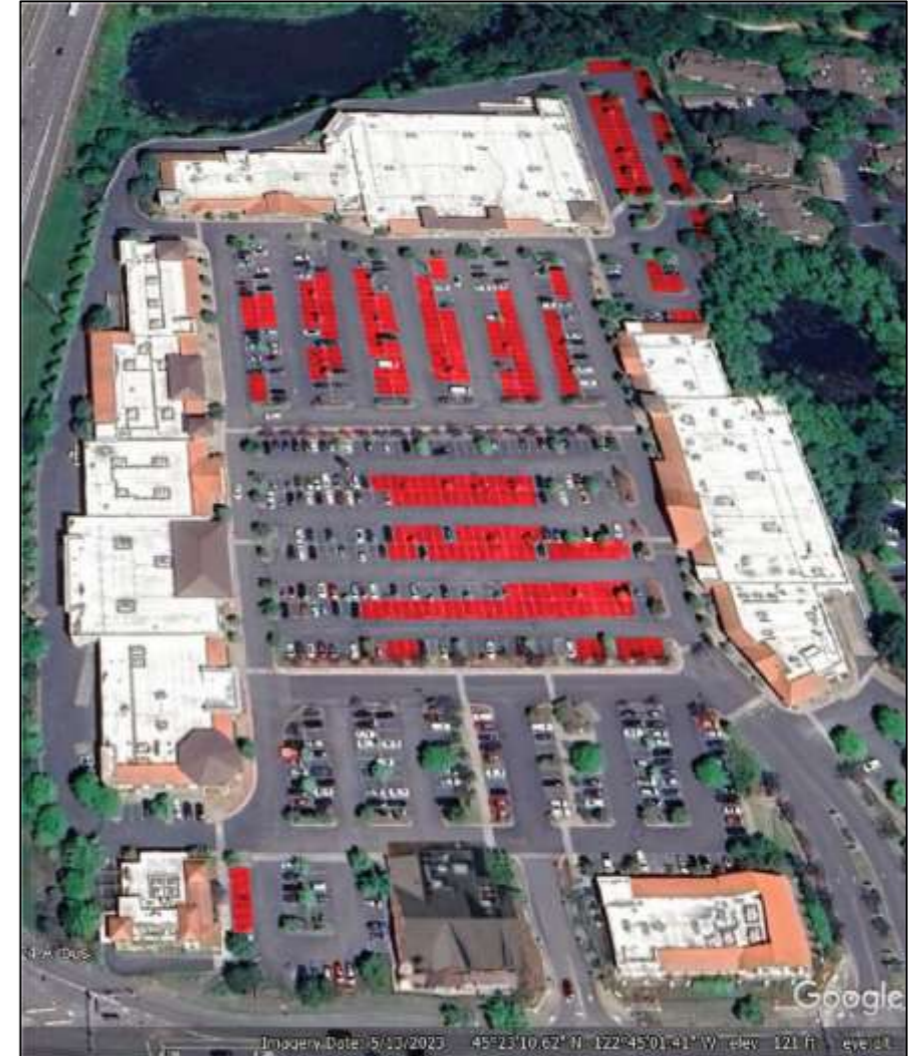
Nyberg Woods parking lot on a Saturday. Under-used gaps highlighted in red.