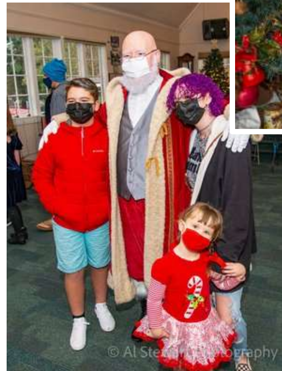
Christmas at the Heritage Center