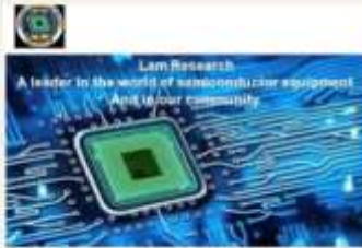
Lam Research: They make the machines that make microchips.