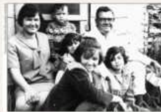
This is Where We Want to Stay