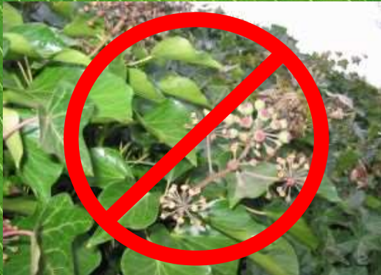
1. Remove Priority Weeds