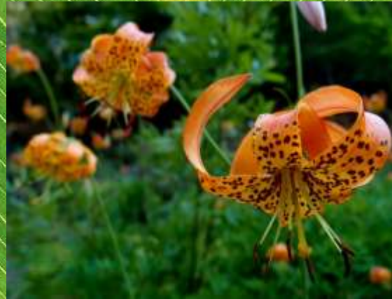
2. Native Plants