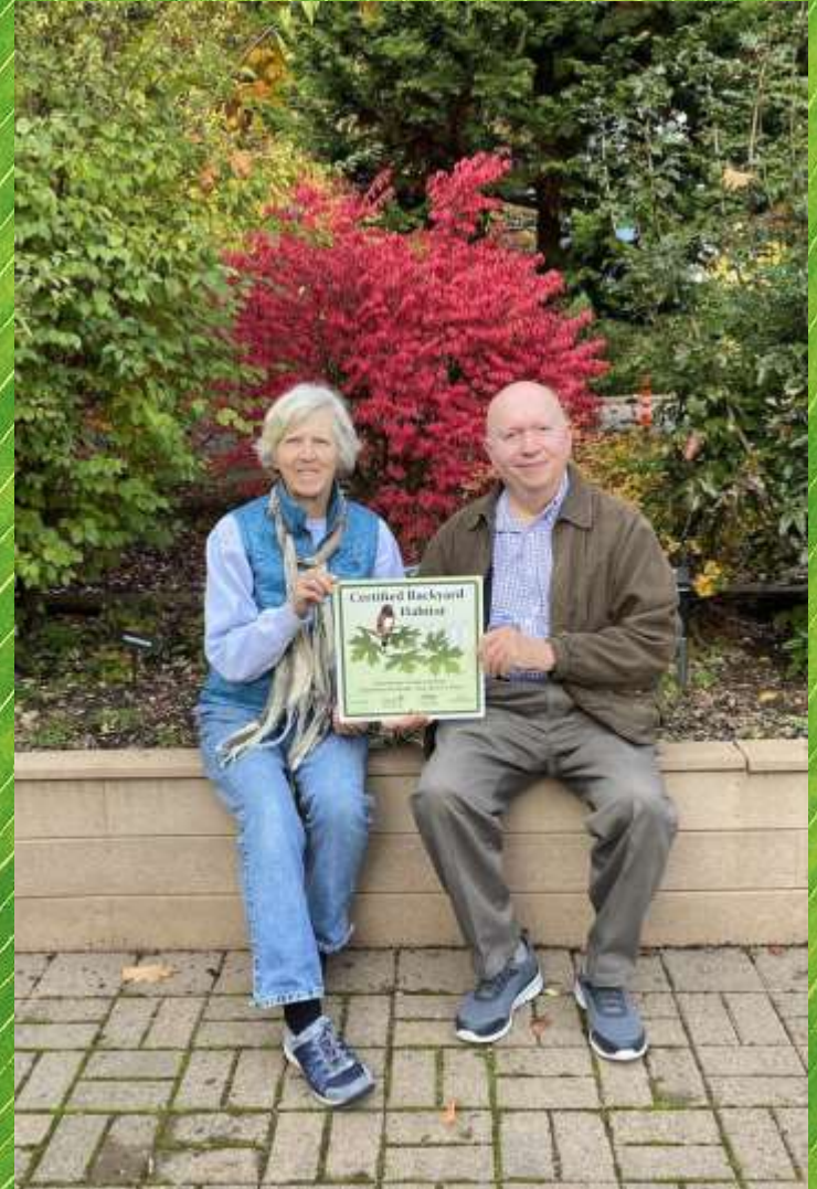
Tualatin Heritage Center, 2021