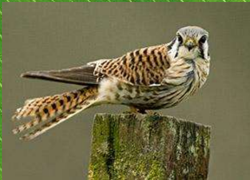
4. Wildlife Stewardship