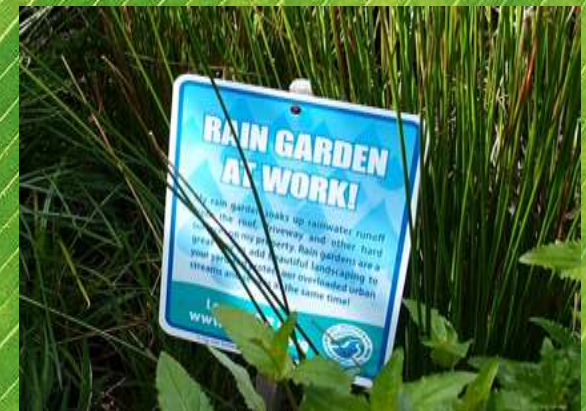
5. Stormwater Management