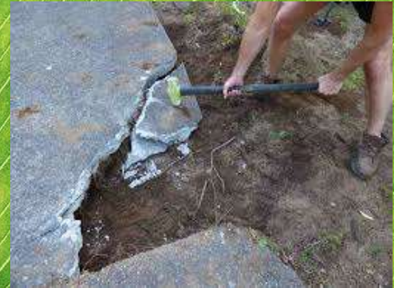
Remove impervious surfaces