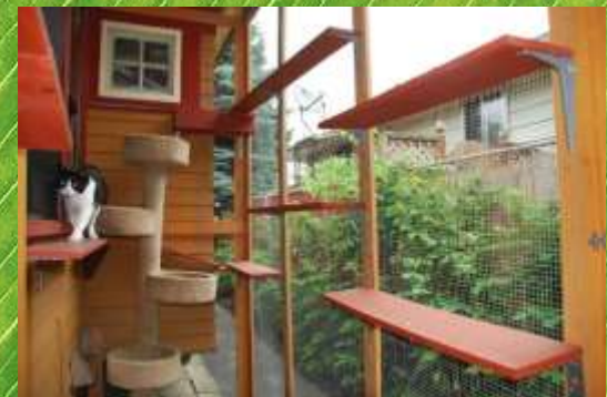
Cats Safe at Home