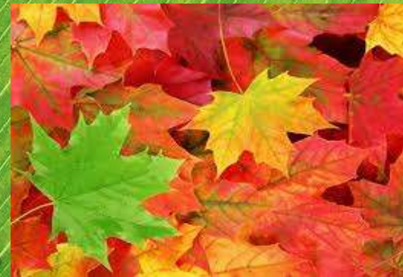
Leave the leaves