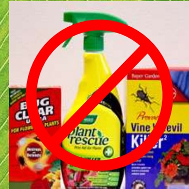
3. Pesticides Reduction