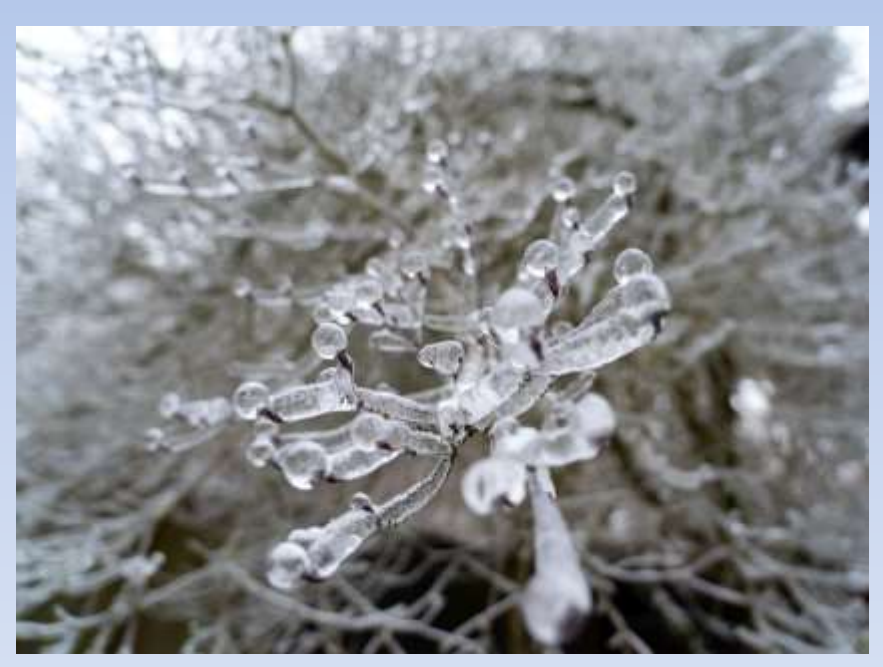
"Winter's Touch" Third Place – Nils Peuser Location – 106<sup>th</sup> Court