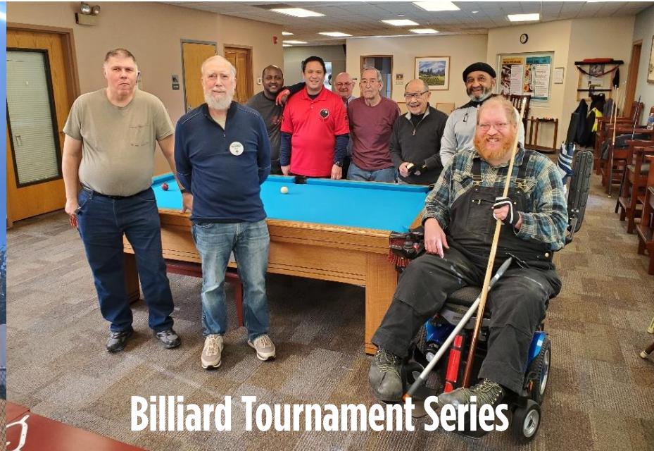
Billiard Tournament Series