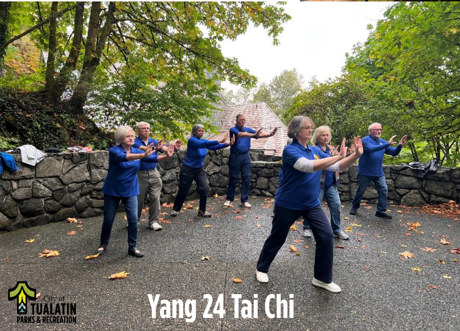
Yang 24 Tai Chi