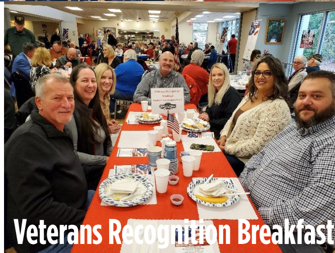
Veterans Recognition Breakfast