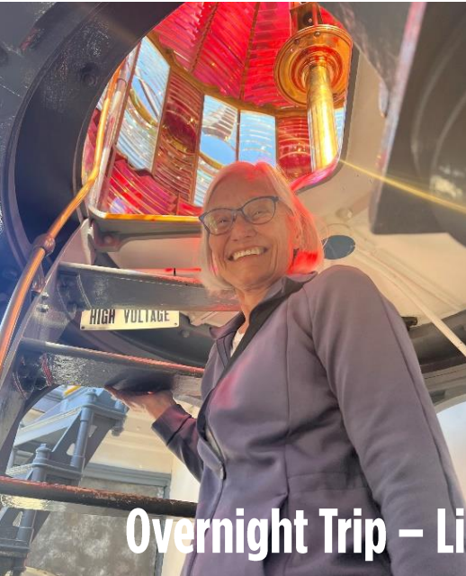
Overnight Trip – Lighthouse Tour