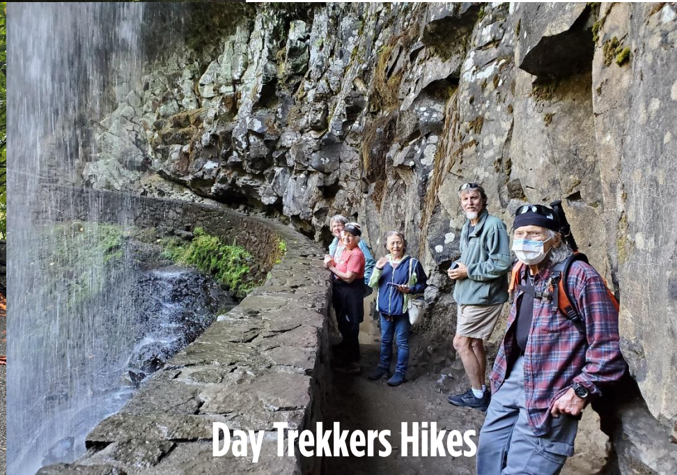
Day Trekkers Hikes