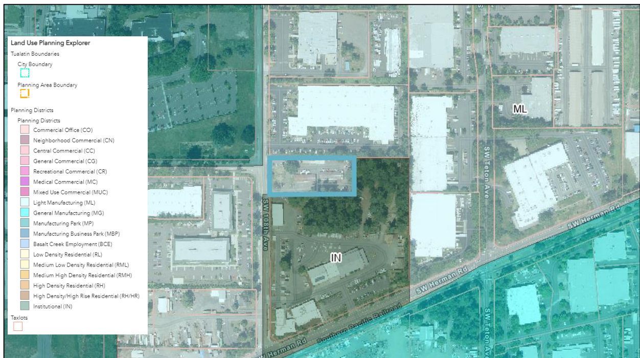
Figure 1 Aerial view of site with zoning (TualGIS)

The site at 18520 SW 108 th Avenue (Tax Lot: 2S122AD00100) is approximately 1.44 acres and zoned Light Manufacturing (ML). Current development on the site consists of two existing pole barn buildings, two ingress/egress gravel driveways that take access from SW 108 th Avenue and unimproved parking areas. There is no existing site or building landscaping. The topography is relatively flat.