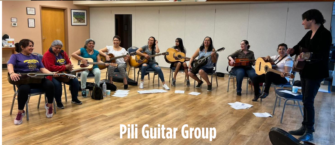
Pili Guitar Group