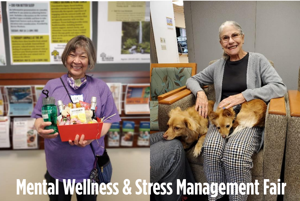
Mental Wellness & Stress Management Fair