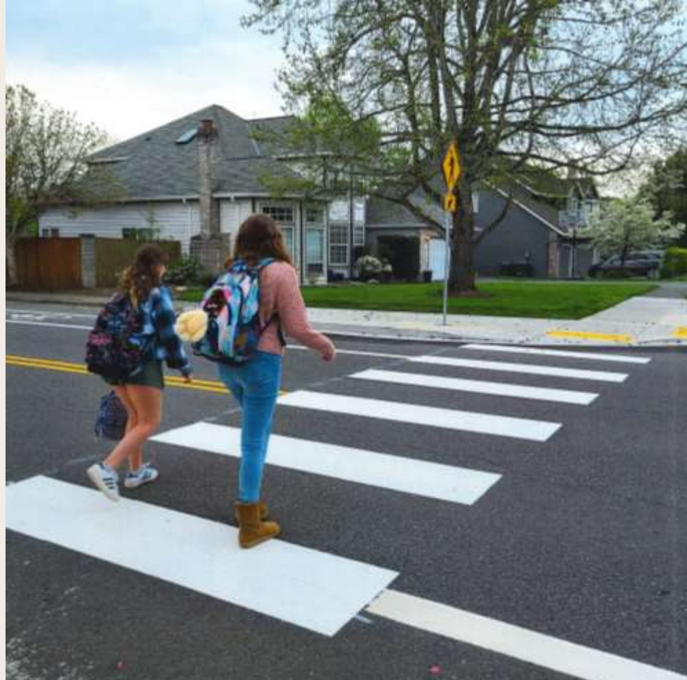
Jurgens Ave & Kiowa St