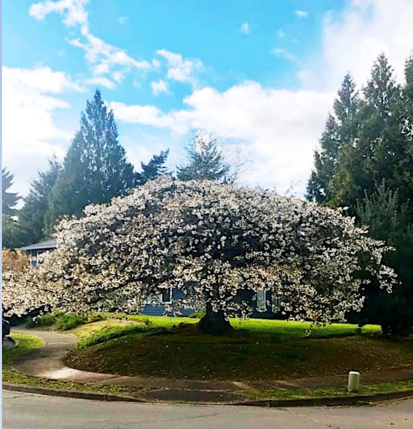
“Tualatin in Bloom”

Second Place – Royce Waxenfelter Location – Makah Court