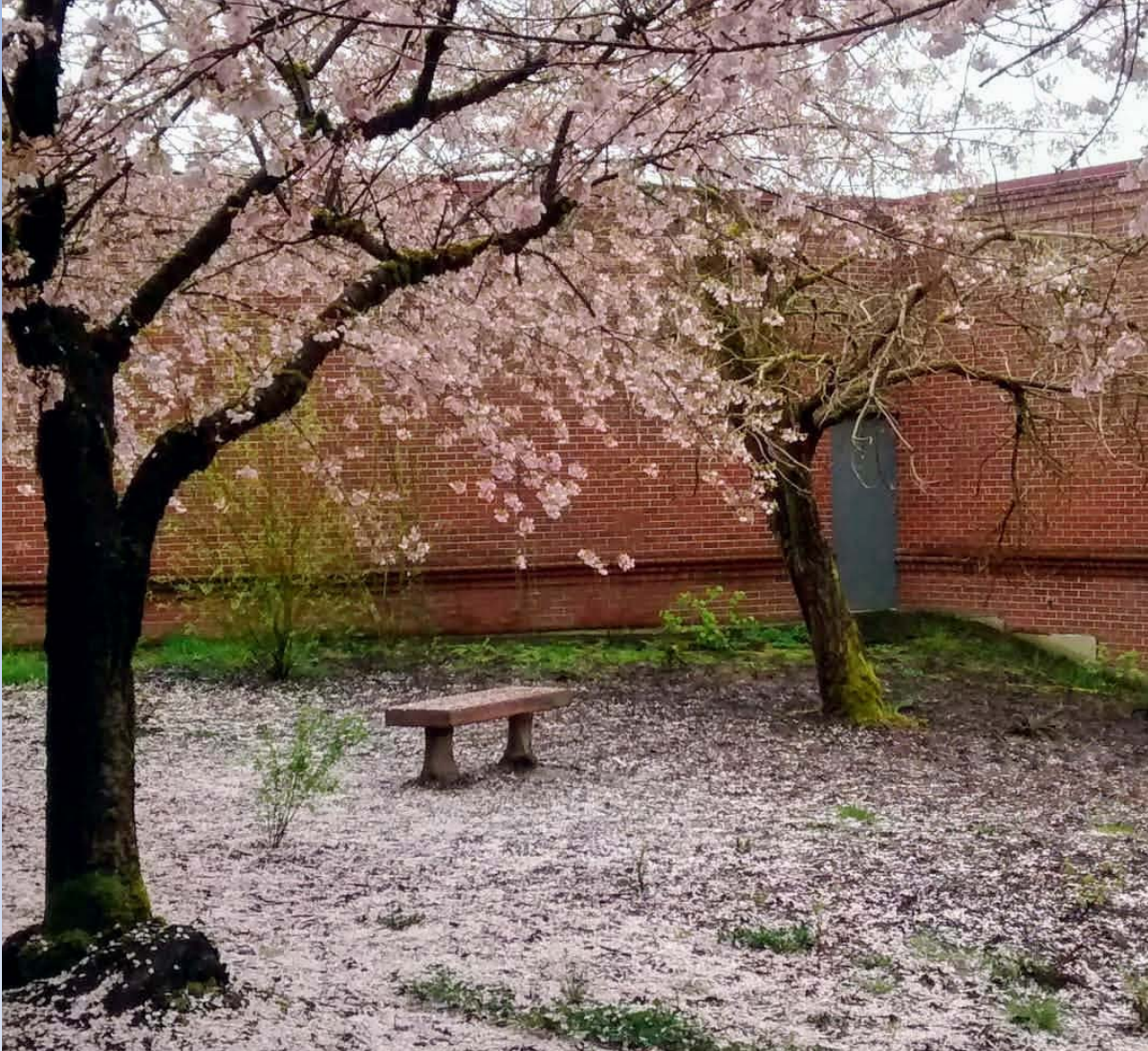
“A Quiet Moment” First Place – Angela Bingham Location – Tualatin High School