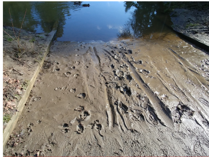
TUALATIN COMMUNITY PARK BOAT RAMP