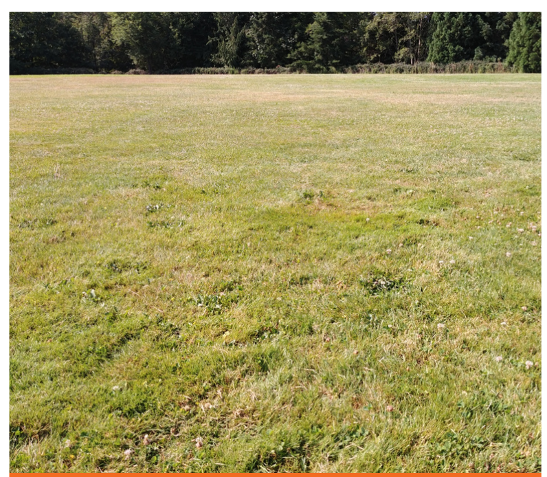
LOWER TURF ATFALATI PARK