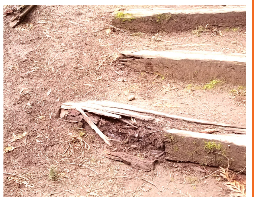
LITTLE WOODROSE PARK STAIRS