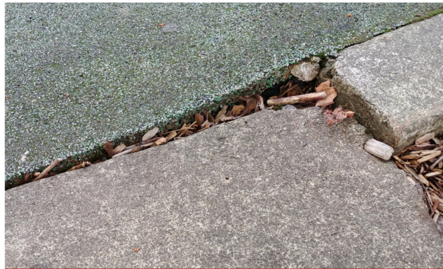
TUALATIN COMMONS PLAZA SURFACE