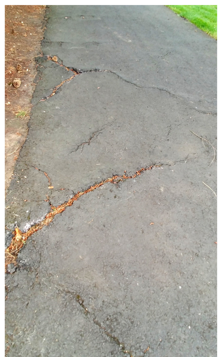
CHIEFTAIN DAKOTA PATH SURFACE