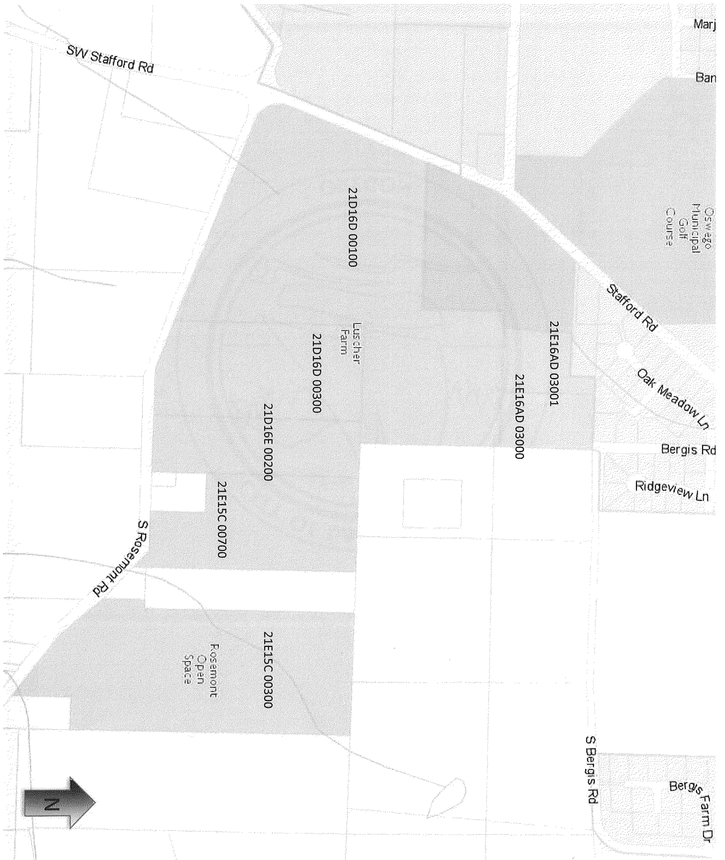
EXHIBIT B – Three City Intergovernmental Agreement “Luscher Farm” Parcels