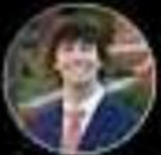
Project Walker Team

Video played from 8:40 to 12:20 https://youtu.be/ALpOROX8prl?si=o2H8WQFIC8ZUvDPa&t=520