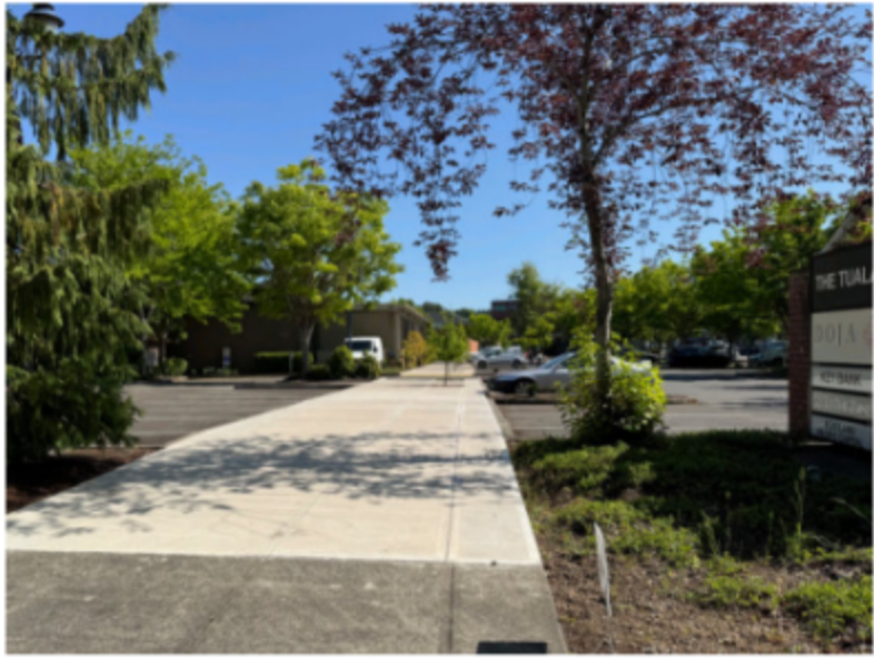
Food Carts on Either Side of This Walkway Would Draw from Park