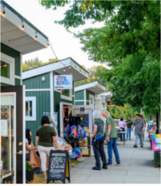
Movable Pop Up Retail Space