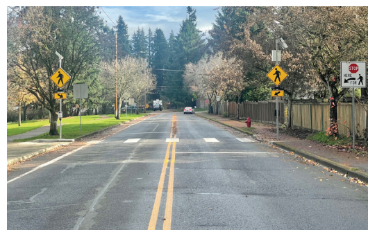
Hazelbrook Rd Crossing