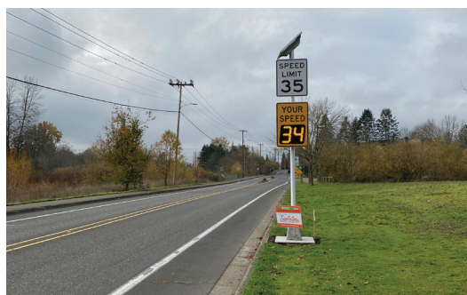
Nyberg Ln at 57th Ave