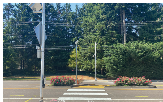
Boones Ferry Rd at Arapaho St