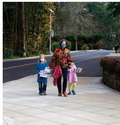
Garden Corner Curves