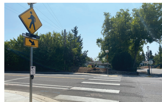
Sagert St at 72nd Ave