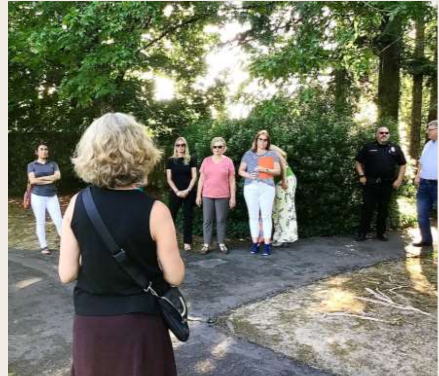
City Council Bus Tour – August 8, 2022