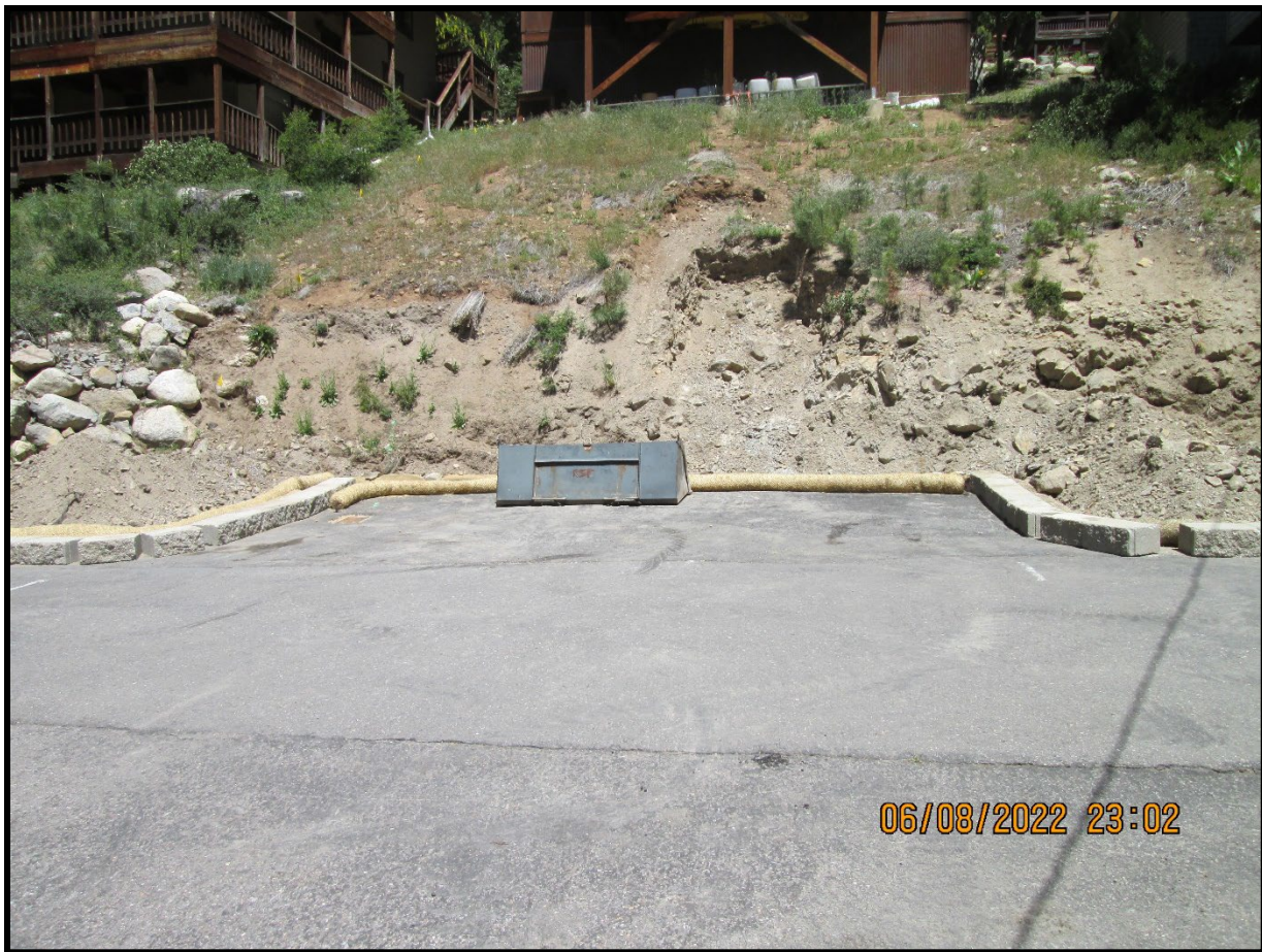
Figure 2: Attempted Restoration of Parking Pad