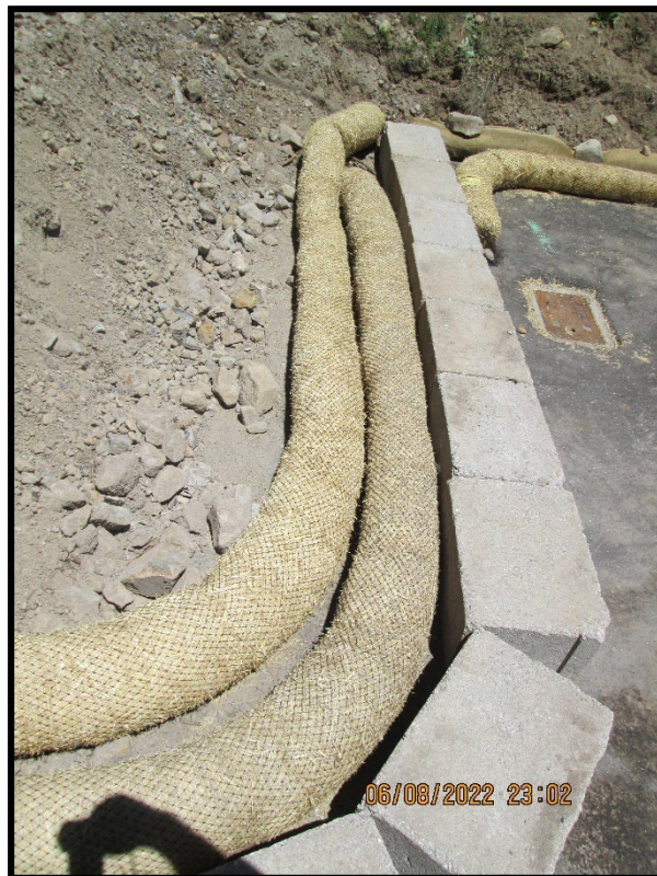
Figure 3: Remaining Asphalt Under Soil