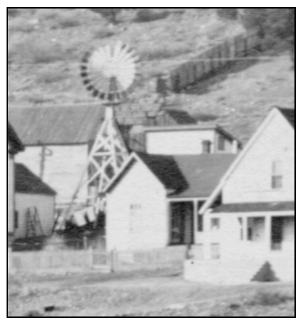
South and east elevations; c. 1913.