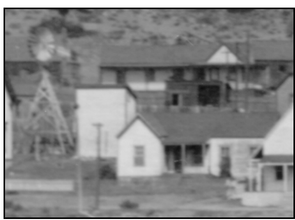
South and east elevations; c. 1905.

*P5. Photographs (continued): Below are two historic photo images showing that the building has changed relatively little since the historic period.