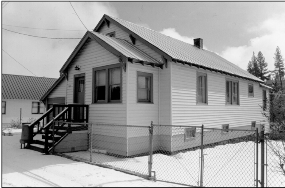
North (primary) and west elevations; south-southwest view; Acc. #134-9-2.