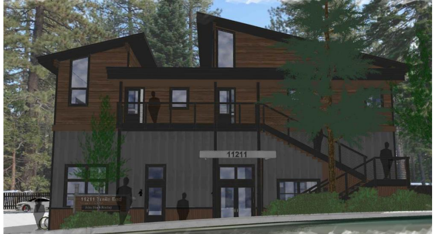
Figure 3: Pioneer Industrial Park Visual Simulation

At the June 16, 2020 Planning Commission meeting, the Commission approved the Pioneer Industrial Park project on Lot 9 of the Phase 3 Pioneer Commerce Center subdivision. The project includes 4,101 sf of industrial space within two buildings, one two-story building with two industrial tenants and two two-bedroom residential units on the second floor and one one-story industrial building. The project is not visible from Interstate 80. The project received a Certificate of Occupancy in March 2025 and is currently leasing tenant spaces.