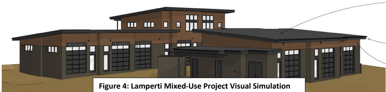
Figure 4: Lamperti Mixed-Use Project Visual Simulation

The Planning Commission approved the Lamperti Mixed Use Project on March 18, 2025. The project includes two buildings with two residential units and industrial and office floor area. Landscaping and fencing were proposed to meet scenic corridor standards. Building permits have not yet been requested for this project.