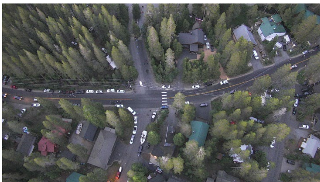
Parking at Fir St and South Shore Dr (entrance to DLPOA Beach). Roadway widths are narrowed on South Shore, but passable until pedestrians are walking – Fir St is single lane only, likely too narrow for fire apparatus.