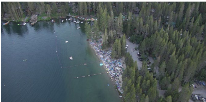
Over-all aerial photo of DLPOA Beach