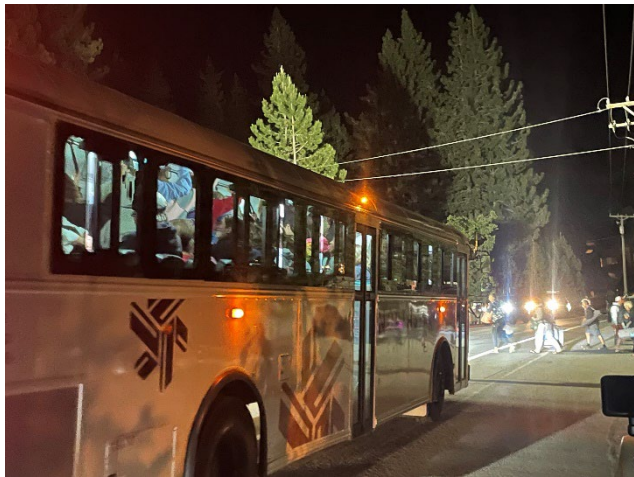
Transit impeded by uncontrolled pedestrian access and movements