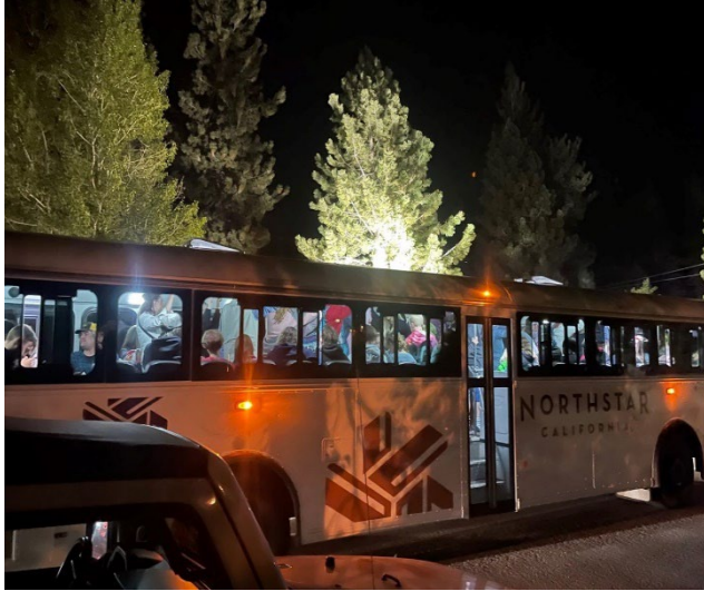
Transit at capacity on egress at DPR and South Shore Drive