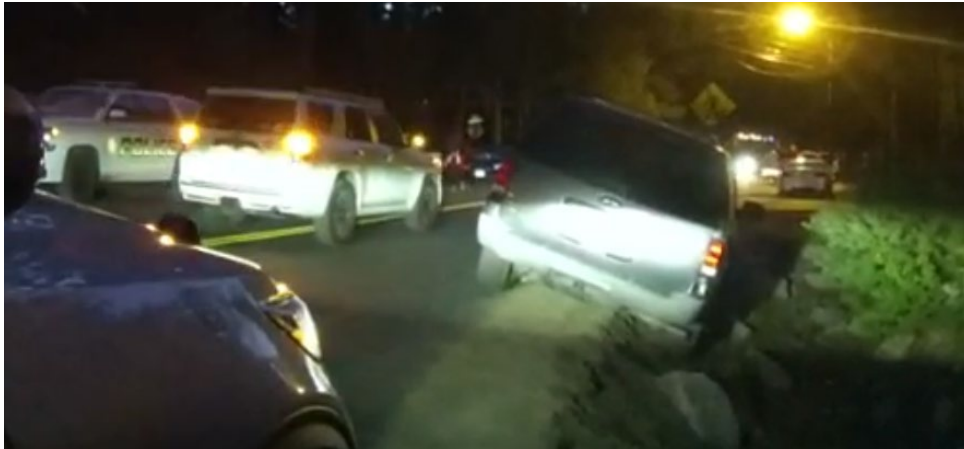
South Shore Dr (vehicle over the edge and abandoned while parking)