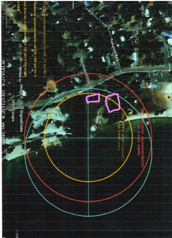
Low mortar detonation during grand finale – magenta is where fall-out landed on vehicles and vegetation – note fall-out zone on private beach area