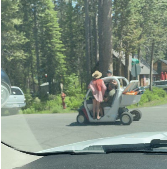
Non roadway legal vehicles (often with unlicensed drivers) with unsafe riders were common throughout the west end residential area