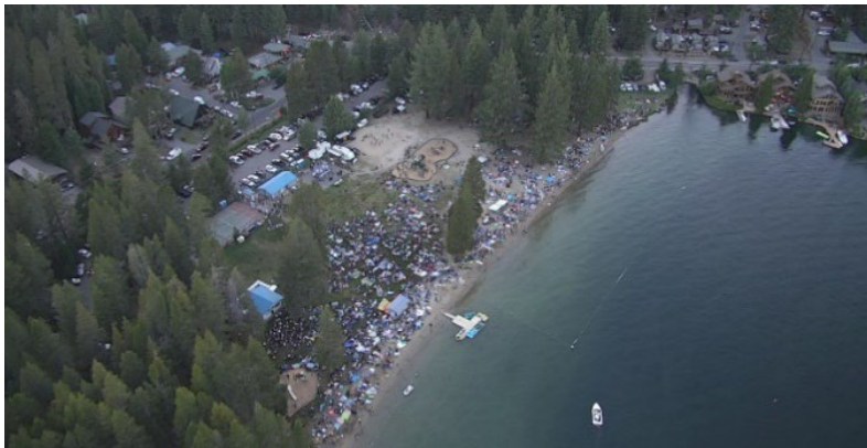
Over-all aerial photo of TDRPD West End Beach