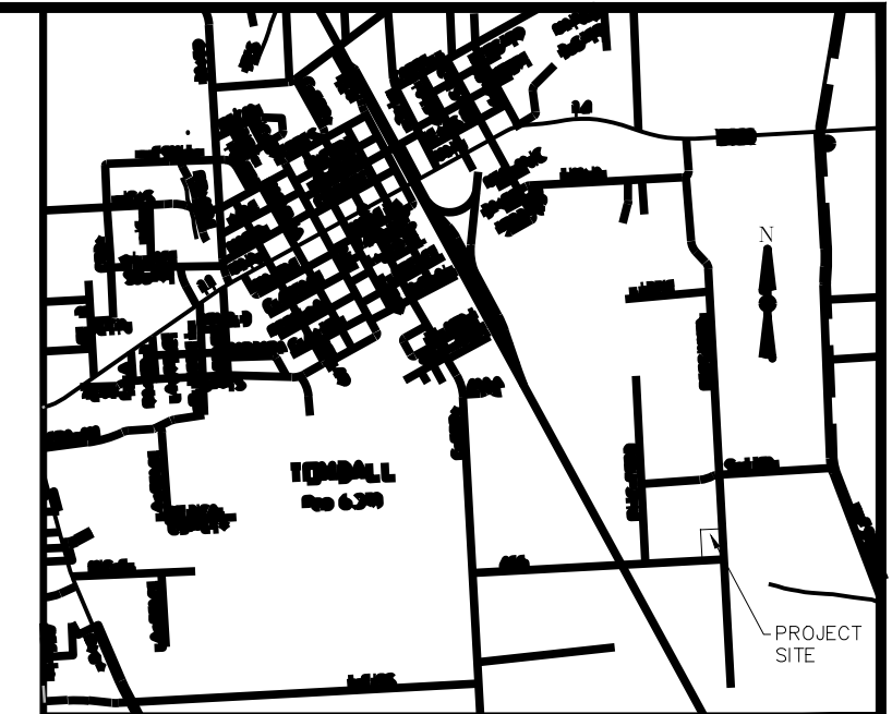
VICINITY MAP N.T.S.