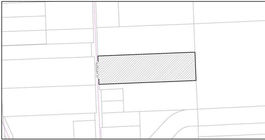
Location: 1100-1200 block (east side of Rudolph Rd.). Being 4.94 acres of land legally described as a portion of Lot 48 in Tomball Townsite, City of Tomball, Harris County, Texas