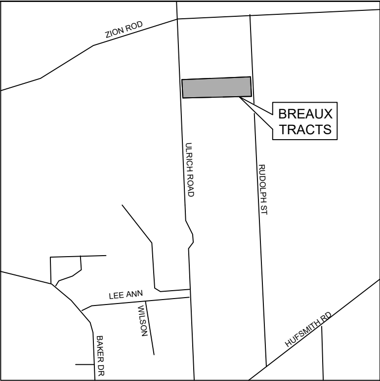
VICINITY MAP NOT TO SCALE KEY MAP 288D