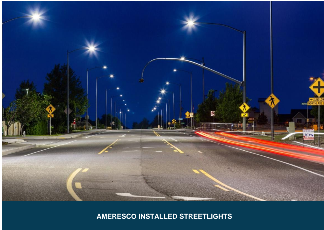
AMERESCO INSTALLED STREETLIGHTS