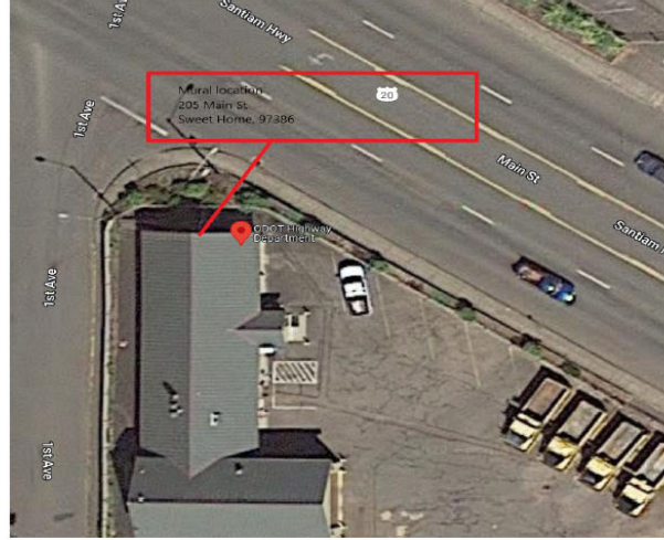
Aerial view of Sweet Home maintenance facility