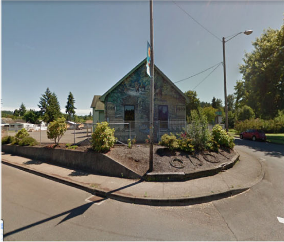
Street view of Sweet Home maintenance facility